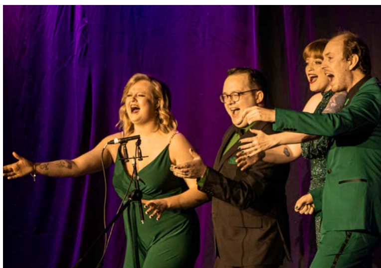
The Sharrow Vale Blues, BinH Gold Medallists