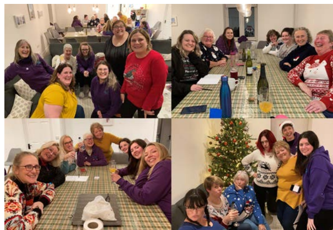
GraceNotes Retreat Quiz Teams

did things a little differently, focusing not only on our sound, but on just being together again, too. We've been separated so often over the last couple of years that we felt a good ol' bonding session was in order.