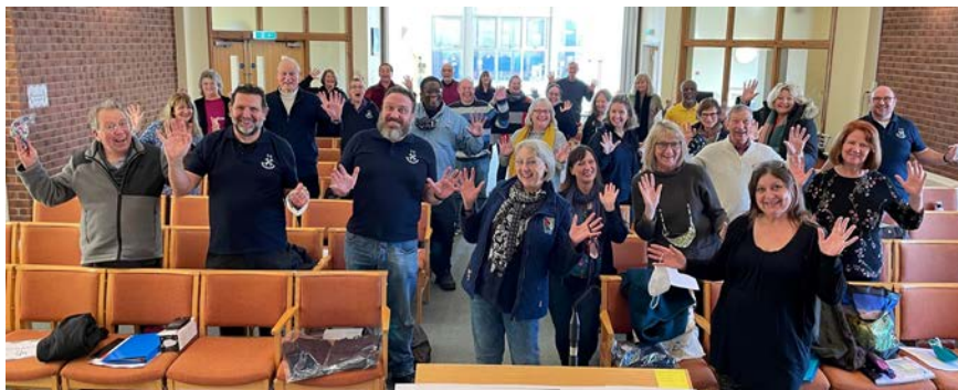
EQ Rendezvous, back together again at long last

With our members spread far and wide, our live rehearsals tend to be planned around contest preparation, while the rest of the year we meet monthly on Jamulus and Zoom so that we can sing together without the expense of travelling. This was particularly practical during the height of the Covid pandemic.