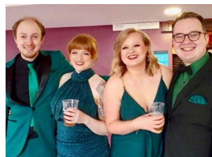
Afterglow, with The Sharrow Vale Blues

What BABS have done with the Youth and Senior contests this year is brilliant, and we'd love to see more integration of mixed barbershop into the mainstream!