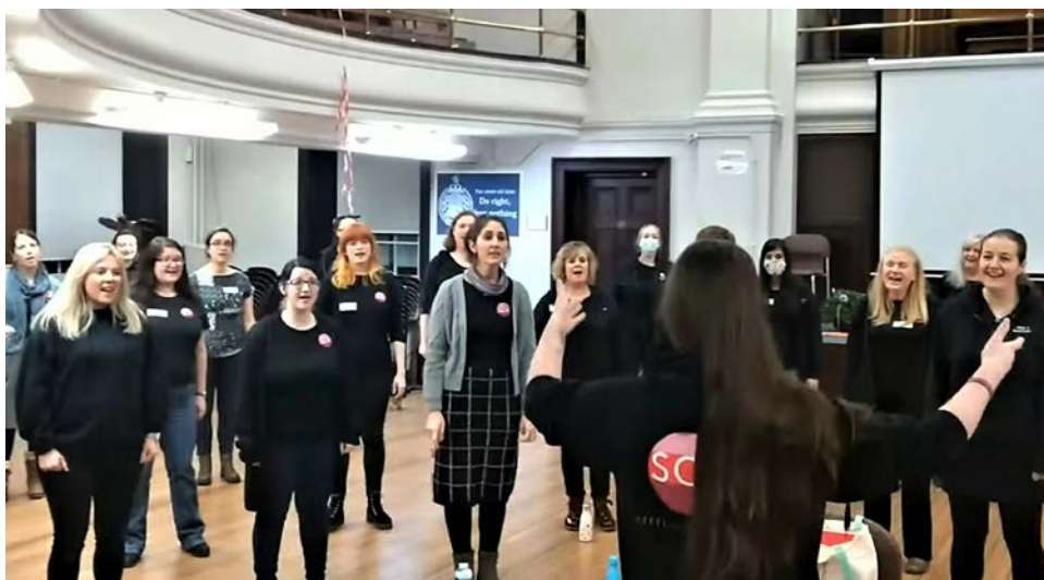
Steel City Voices Open Rehearsal

our highlights from 2021. We felt like we'd achieved quite a lot considering we had only had four official rehearsals. Now Steel City Voices has so much to look forward to in 2022: international voice coaching, our retreat weekend, and LABBS Convention! SCV's first