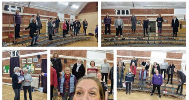
Chorus Iceni, back on the risers

the risers - we actually set up our risers for the first time since March 2020. So good to get back up there and mix up the sections!