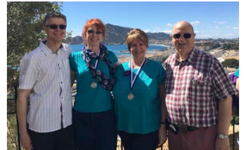
Crown Derby, enjoying the sunshine in Spain

We’ve commissioned a new custom arrangement that will suit our unique blend of voices, and we can’t wait to start work on it. We’re thrilled to be