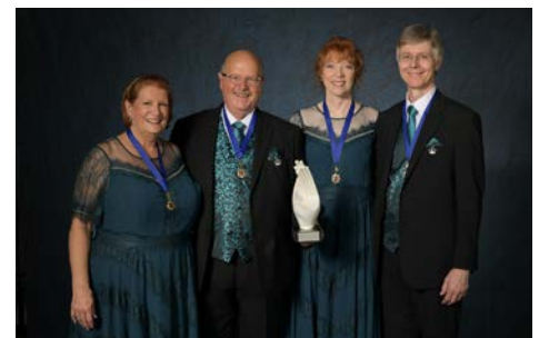
Crown Derby, BABS Senior Champions

performing at the BABS Saturday show too. In February, we’ll all be involved in the first in-person UK Harmony Brigade since the pandemic. We’re also hoping to go and compete at IABS this year. Meanwhile, we love getting involved in local music festivals and we would encourage all quartets to do the same! They are often undersubscribed and a really fun experience. Most excitingly, we’re also waiting for BHS to confirm whether we’ll be eligible to sing at the International Seniors competition at Midwinter Convention next year.