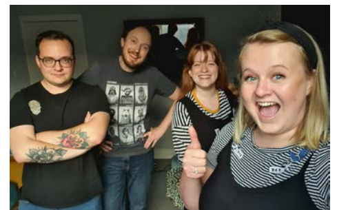
The Sharrow Vale Blues