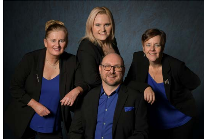
Perfect Match, BinH Bronze Medallists