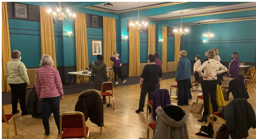
Crystal Chords, warming up with 'Papas got a head like a ping-pong ball'