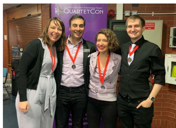
Met44, BinH Silver Medallists

Over the past couple of years, Met44 have had lots of Zoom rehearsals and some socially distanced rehearsals in parks (lucky park visitors!), before being able to finally have 'normal' rehearsals again. They also made a lockdown music video of their version of the Backstreet Boys' 'I Want It That Way'. Fun fact about Met44: their