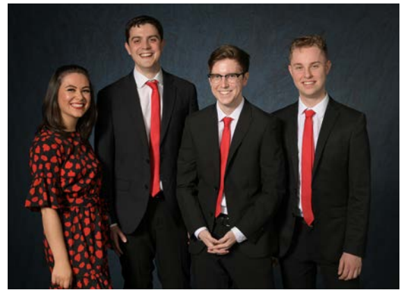
Hot Ticket, BABS Youth Champions

We have five new songs in the works! We're really excited about getting more coaching and developing our sound, but we want to learn some repertoire songs and enjoy singing together for a bit before we decide to enter any more competitions. We've been invited to the BABS Saturday show and we'd absolutely love to have the opportunity to do more shows!