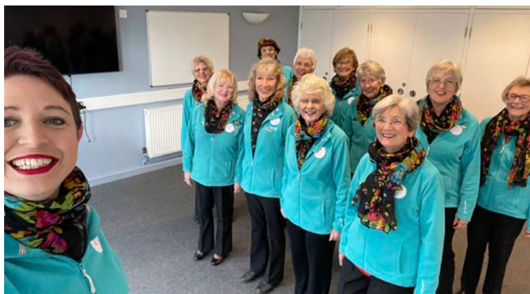
Celtic Chords, getting ready to sing at Carnon Downs Memory Cafe