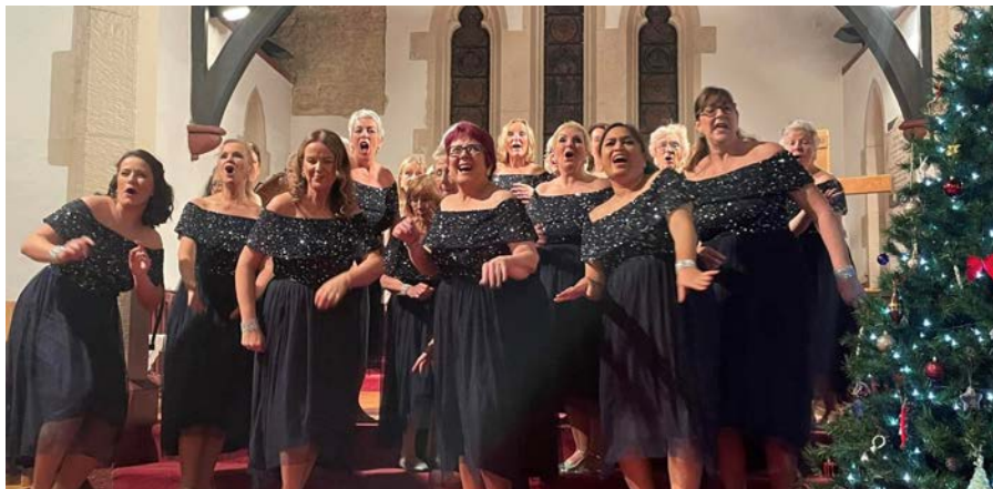
It might have been cold, but it didn't stop us from sparkling!