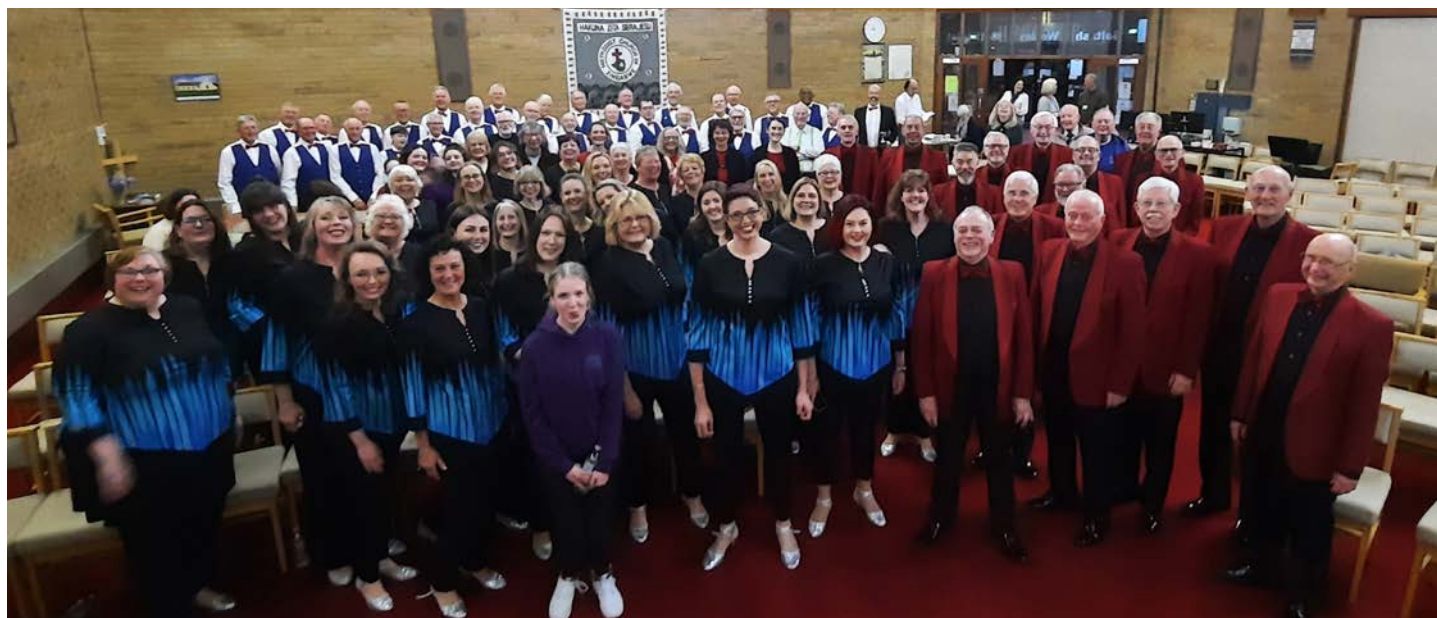
GraceNotes Acapella at Saltash Music Festival, with BABS choruses the Kingsmen and Ocean City Sound