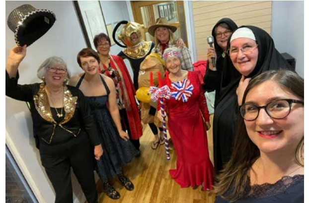
Bari section's BF's got talent sketch