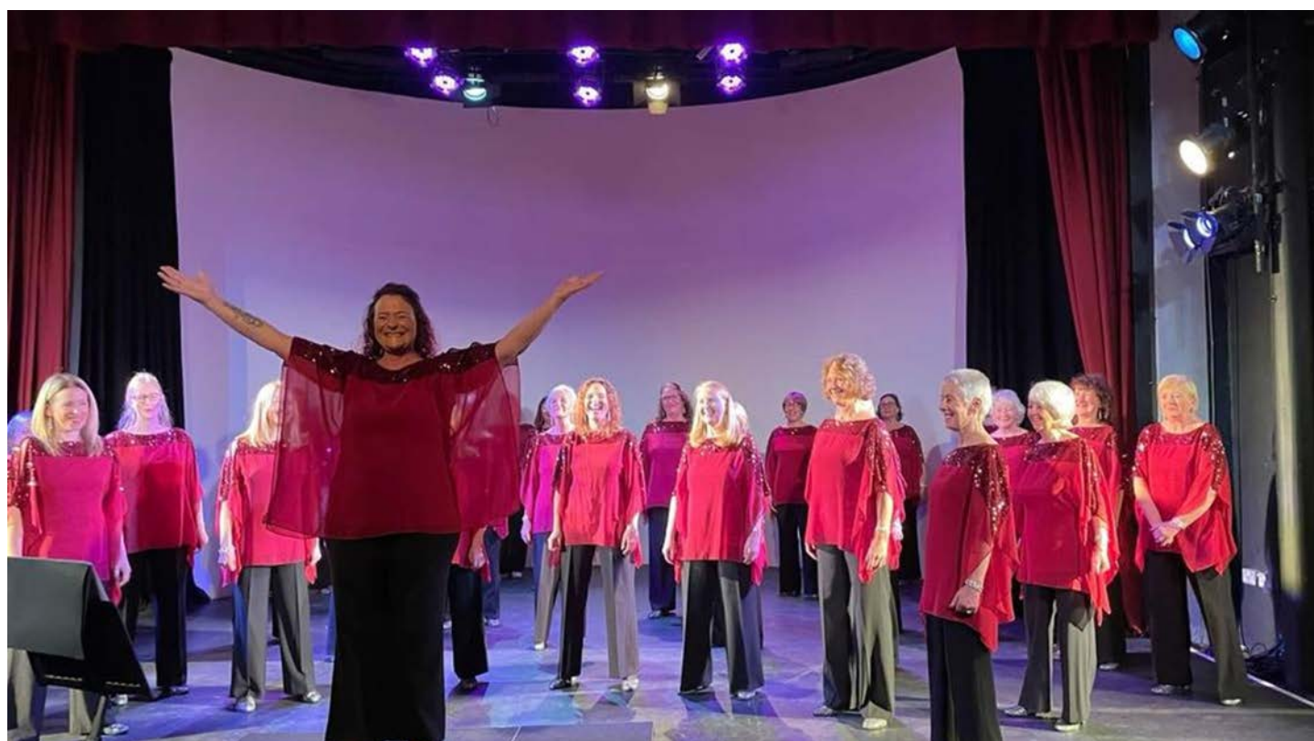
Fascinating Rhythm's Ups and Downs concert