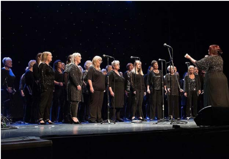
The Red Rosettes , performing at the Lancashire Choir of the Year Competition