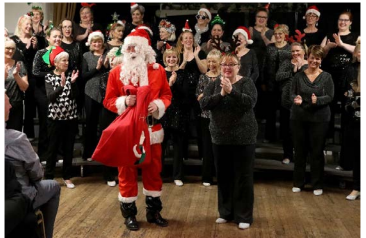
Santa delivers at our Friends and Family Concert