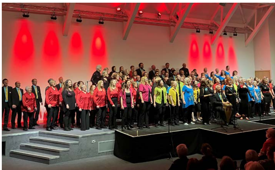
Big Bristol Barbershop Bonanza - Avon Harmony, Black Sheep Harmony, Bristol A Cappella, Bristol Fashion, Fascinating Rhythm, Great Western Chorus, and The Bristol Mix