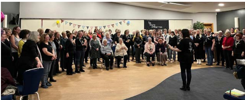
The White Rosettes 45th Anniversary Celebrations