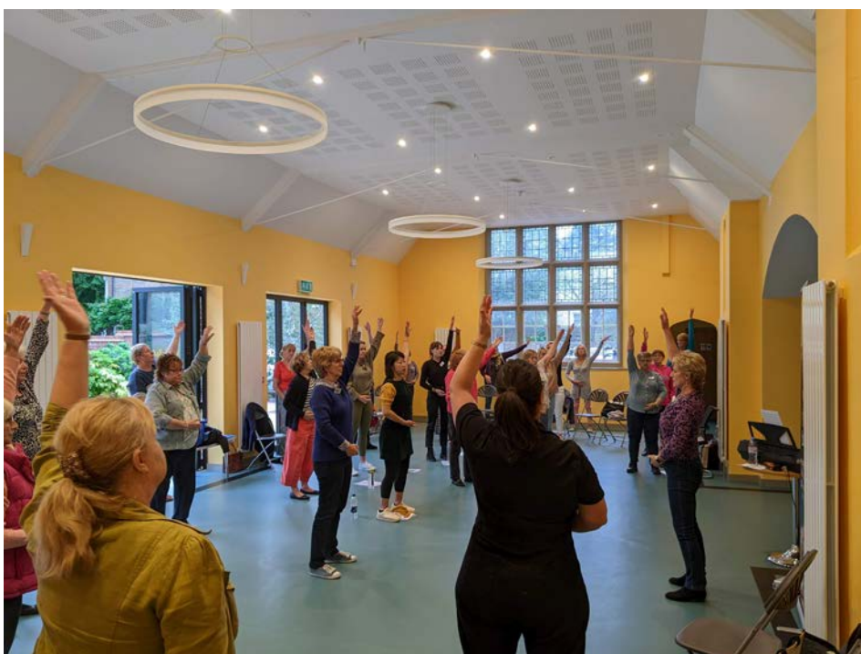
Signature A Cappella Singers, and their Love to Sing signets