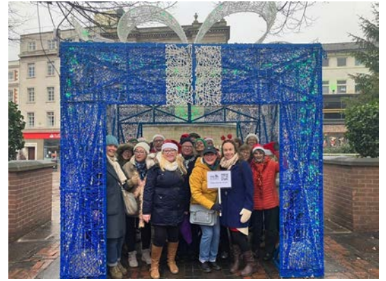
The Gems, all wrapped up