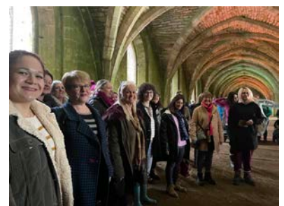
The White Rosettes singout at the fabulous Fountains Abbey