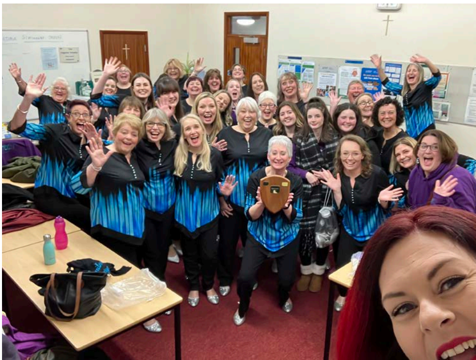
GraceNotes celebrate their success at Saltash Music Festival, winning not only their class, but also the awards for best barbershop performance, and best vocal performance of the festival.

Collaboration and community are our main focuses this year and we want to celebrate the wonderful music made down here in the South West, by singing with as many regional choruses as we can at community festivals, events and concerts. We were so inspired by the LABBS Unconventional Convention regional hubs in 2021, and really enjoyed hosting the South West one, so we plan to host another regional barbershop event later this year.