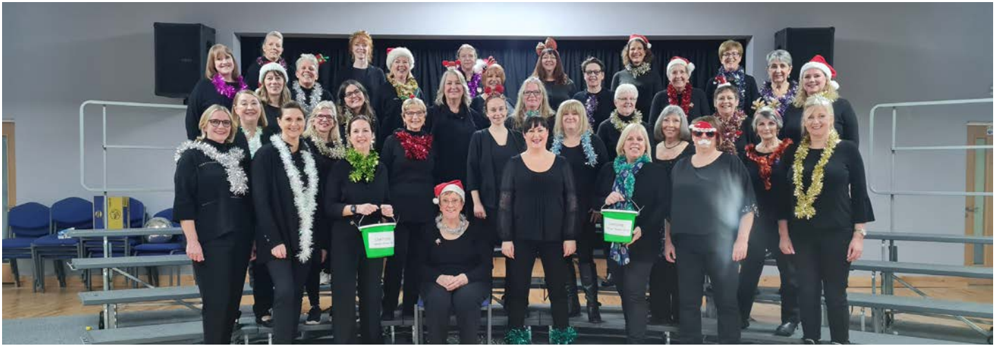
GEM Connection Open Night