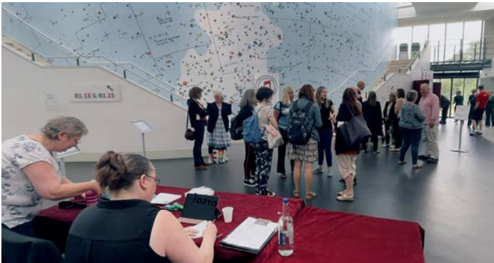
Prelims attendees, excited to be back!

The paired quartets coaching model seemed as successful as ever, with many celebrations and much progress made. It is heartwarming as a coach to see the bond that develops between quartets in this situation, and how supportive and encouraging everyone is of each other.