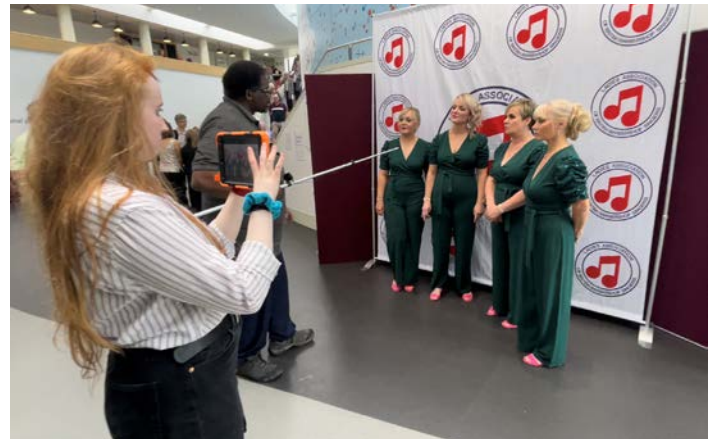
Prelims first place quartet, IN HOUSE, being interviewed by LABBS volunteers