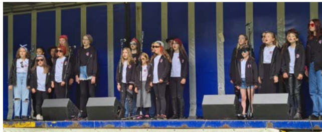
Junior Fascinating Rhythm on stage

In March, the girls competed in the Thornbury Eisteddfod as part of Thornbury Arts Festival 2022 .