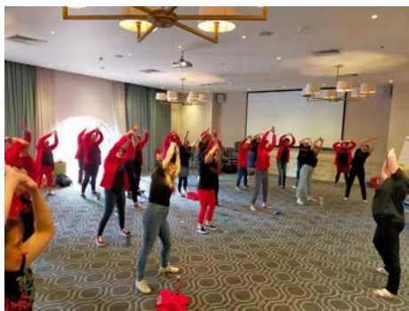
Bristol Fashion, stretching it out

'More than anything though, I adore the Talent Show. It always entertains, but this year was outstanding! The baris were hilarious, the tenors had a frog chorus, the basses and leads led quizzes, and a rousing God Save The Queen, complete with kazooos, finished the evening in BF style.'