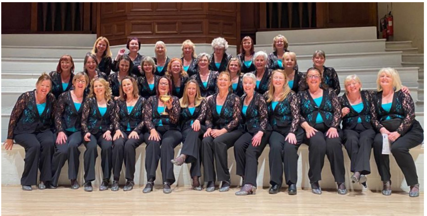
Cheltenham Festival of Performing Arts Gold Cup winners, Fascinating Rhythm