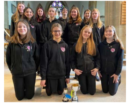
Junior Fascinating Rhythm Seniors

On a soggy Sunday in June, JFR entertained an intimate audience at the Yate Rocks... in the Park Festival from another truck-side stage.