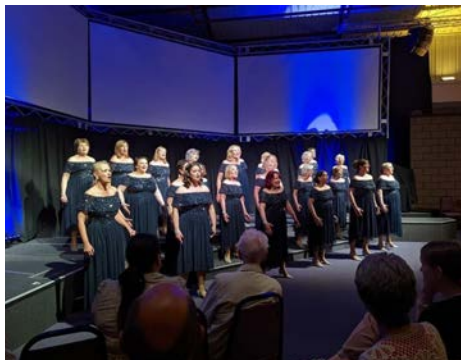
Crystal Chords fundraising for Stockport Foodbank