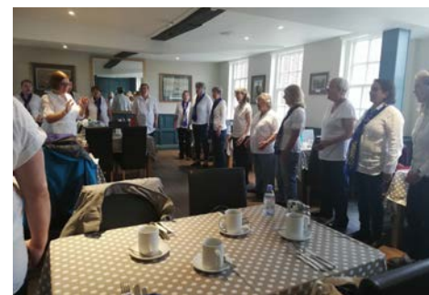
Harmony InSpires rehearsing before the Wantage Music Festival, at The Bear Hotel, Wantage