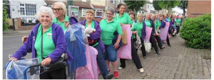
Shall we warm up then? No let's do a conga!

straight away and a few songs were sung (quite reservedly for us!). On arrival, before going to get ready and warming up, we first did a conga down the street!