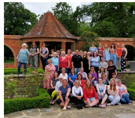
Bristol Fashion at retreat

'BF's retreat was full of activity, singing and fun. We did do a lot of walking around the maze of corridors in our hotel, which certainly made us conscious of breathing techniques! The rehearsal sessions were lively and interesting, and each one took us a step closer to the type of singing we're aiming for.'