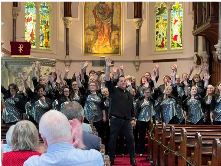
Spinnaker performing at Bournemouth Music Competitions Festival