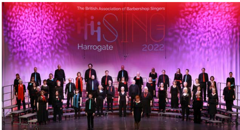
The Bristol Mix

Amazingly, almost 90% of those singing with TBM on the BABS stage had never won a chorus gold medal before, some had never won a medal of any description, and some had never even been on a barbershop stage. The resulting buzz was tremendous, with so much positivity being taken back to all our other choruses. Following Convention, some members wrote: