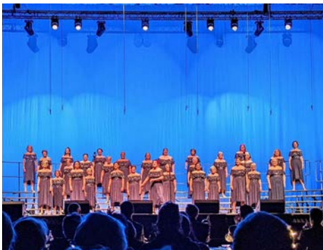
A cheeky audience snap from EBC in Helsingborg