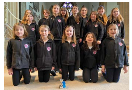
Junior Fascinating Rhythm Juniors