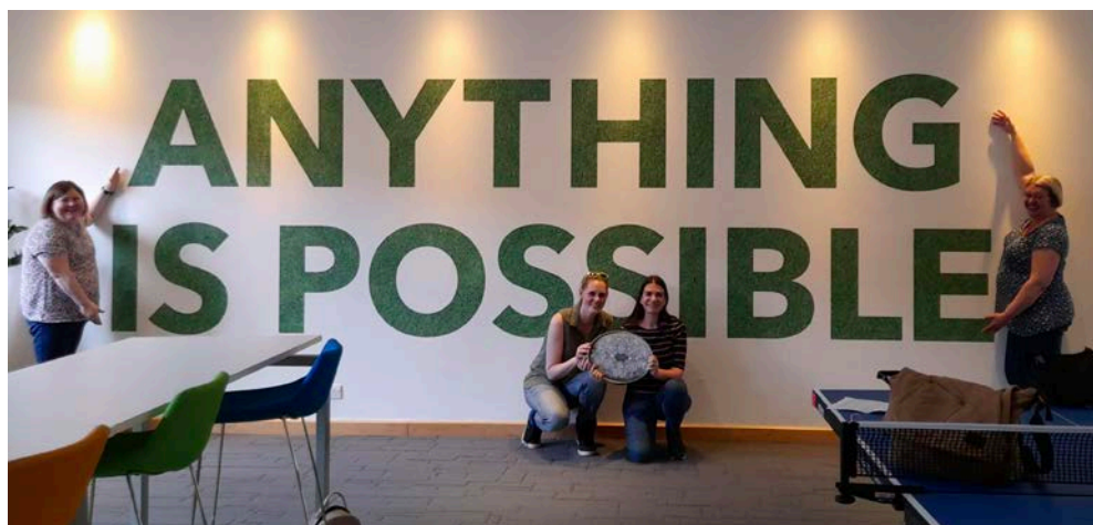
Anything IS possible!