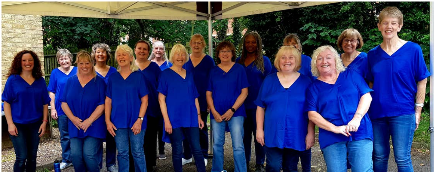
Junction 14 at Stony Open Gardens