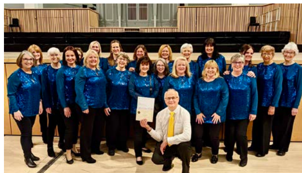
Albacappella at the Aberdeen Music Festival – joint first place in the open a capella category