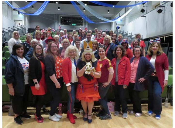
Spinnaker's Platinum Jubilee celebrations