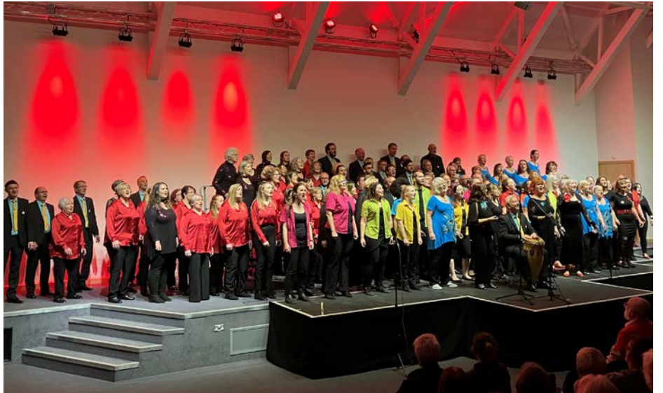
Big Bristol Barbershop Bonanza - Avon Harmony, Black Sheep Harmony, Bristol A Cappella, Bristol Fashion, Fascinating Rhythm, Great Western Chorus, and The Bristol Mix