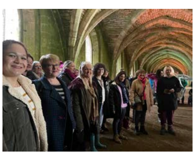
The White Rosettes singout at the fabulous Fountains Abbey