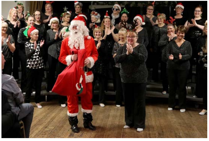
Santa delivers at our Friends and Family Concert