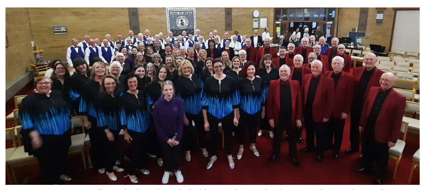
GraceNotes Acapella at Saltash Music Festival, with BABS choruses the Kingsmen and Ocean City Sound