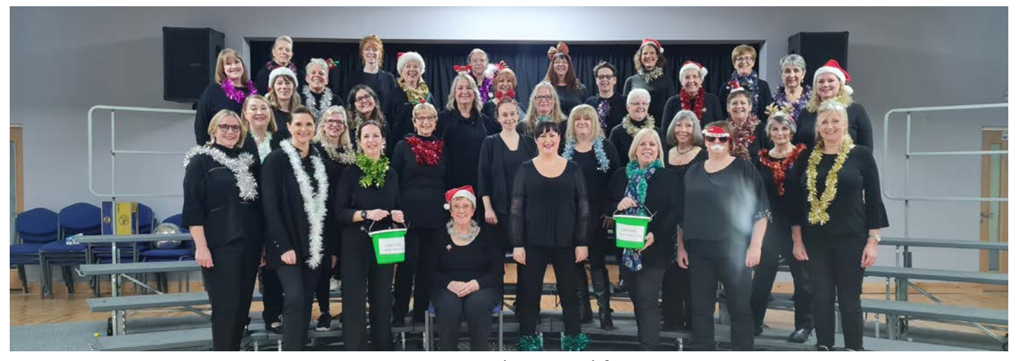
GEM Connection Open Night