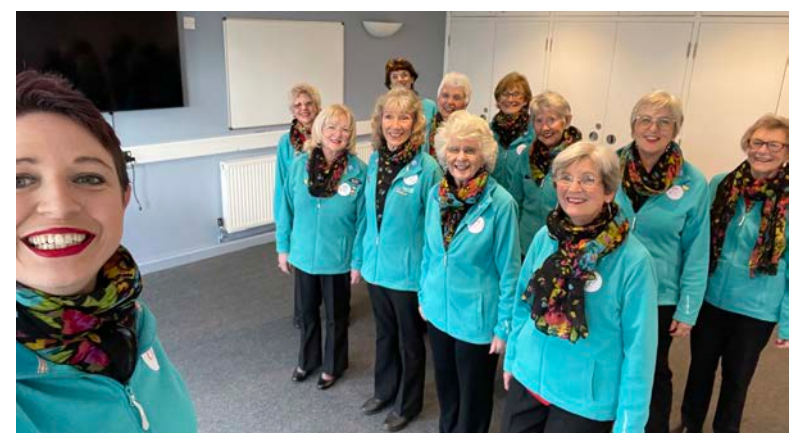
Celtic Chords, getting ready to sing at Carnon Downs Memory Cafe