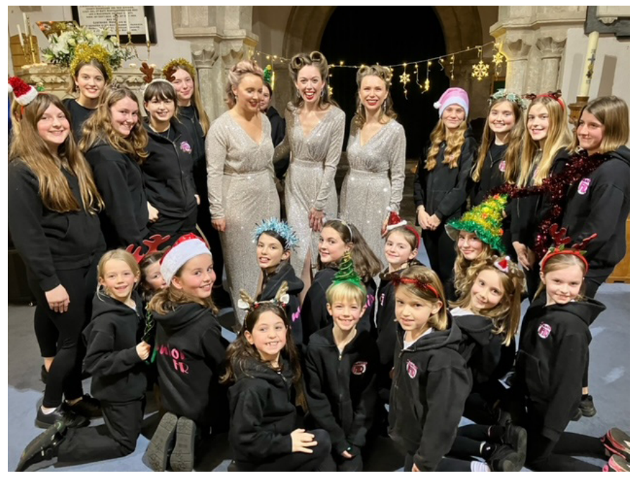
Junior FR and The Femmes