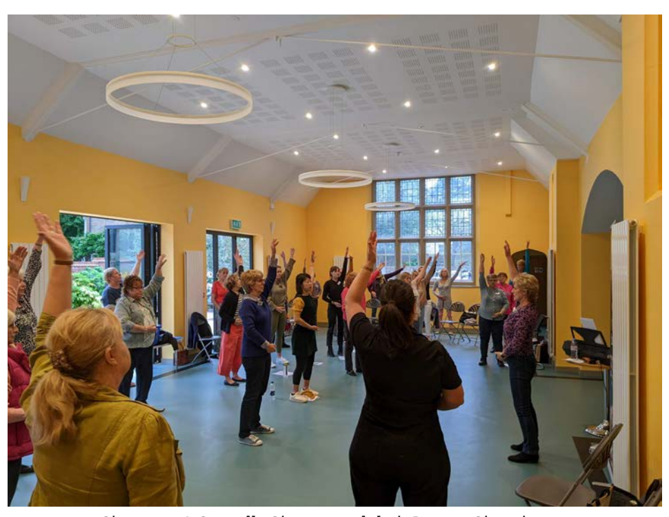
Signature A Cappella Singers, and their Love to Sing signets