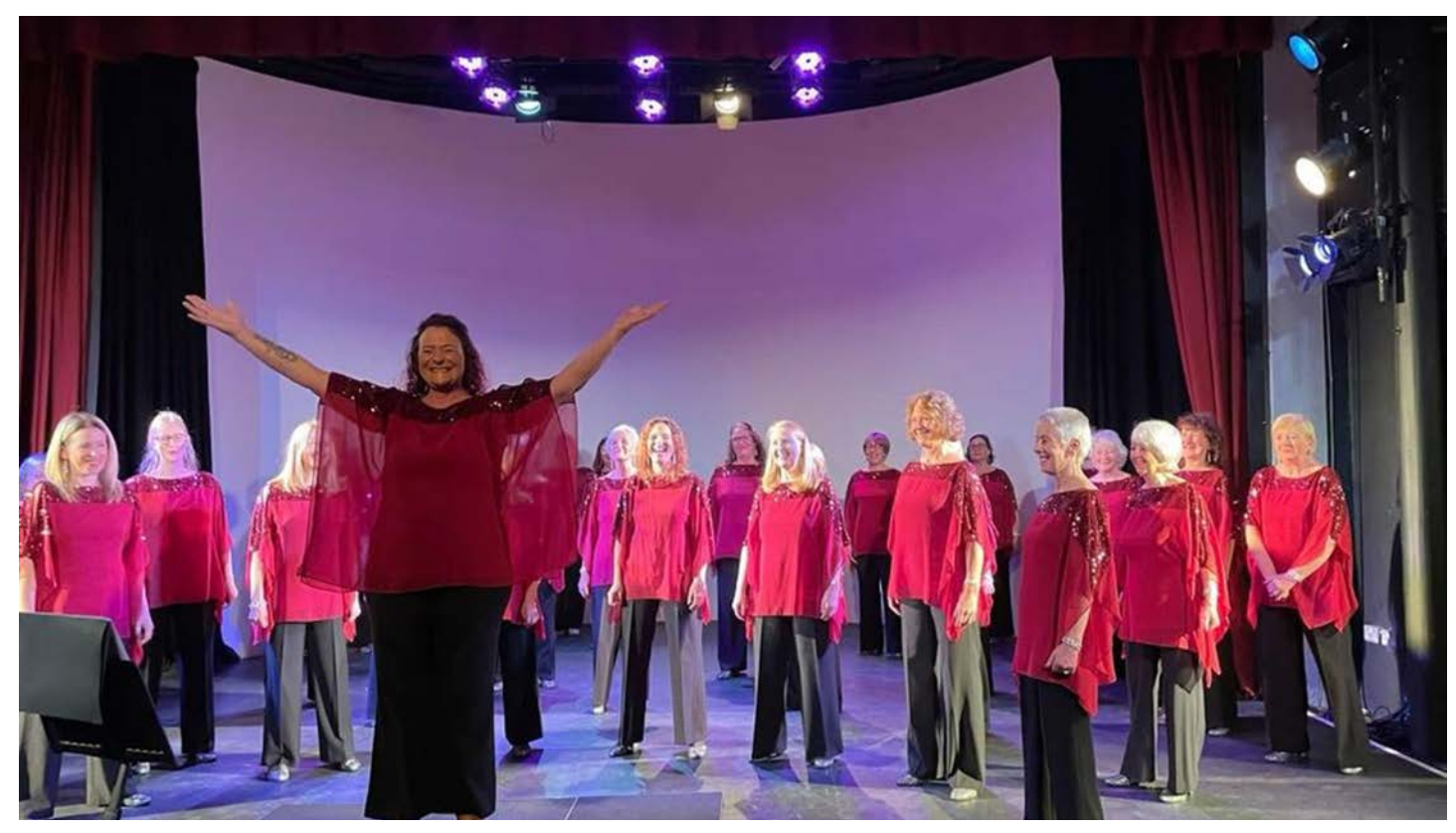
Fascinating Rhythm's Ups and Downs concert