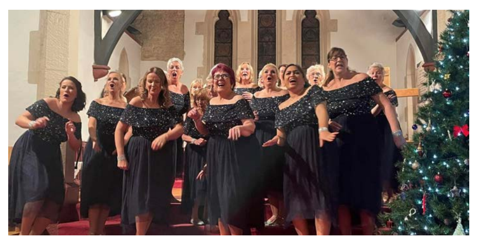
It might have been cold, but it didn't stop us from sparkling!