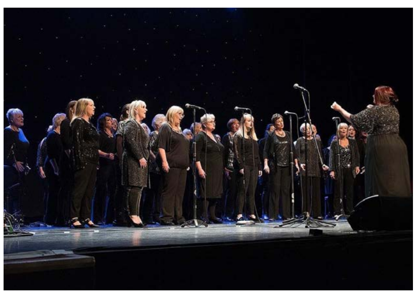
The Red Rosettes , performing at the Lancashire Choir of the Year Competition