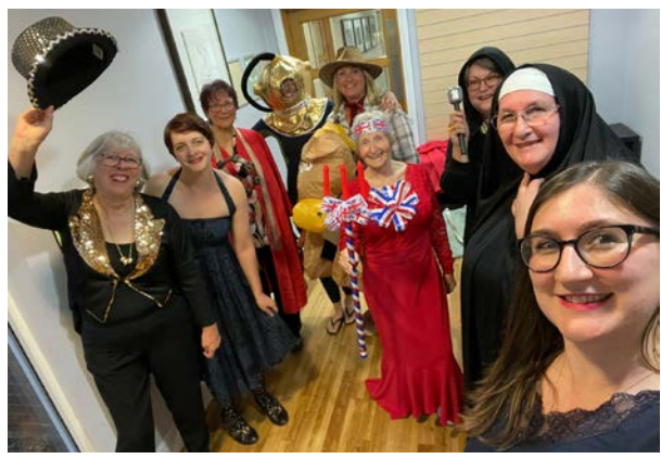
Bari section's BF's got talent sketch