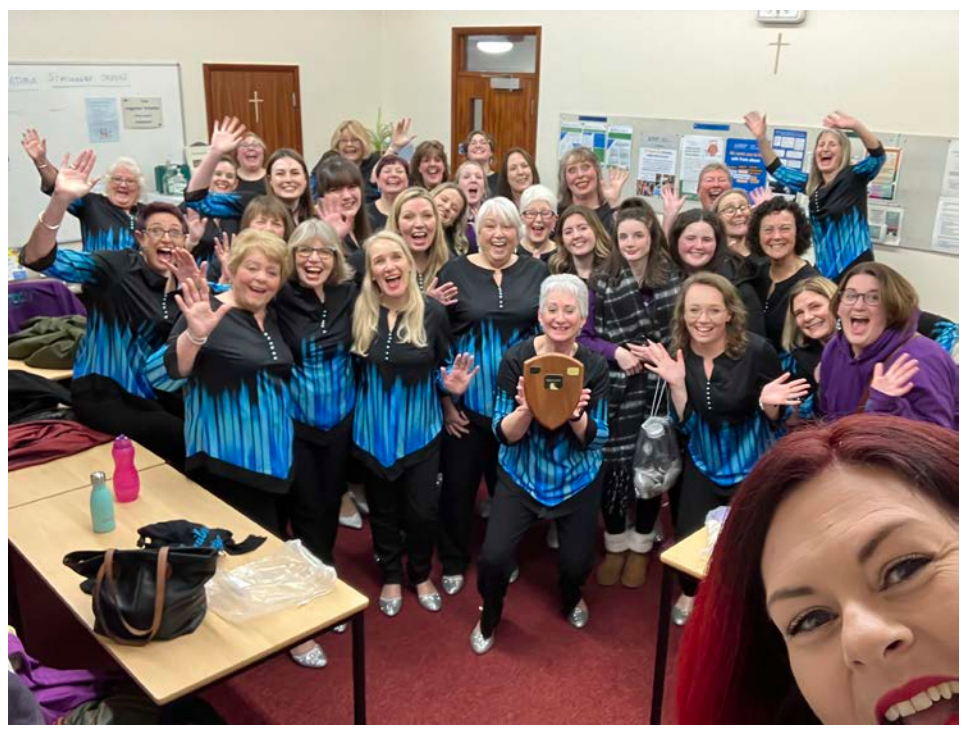
GraceNotes celebrate their success at Saltash Music Festival, winning not only their class, but also the awards for best barbershop performance, and best vocal performance of the festival.

Collaboration and community are our main focuses this year and we want to celebrate the wonderful music made down here in the South West, by singing with as many regional choruses as we can at community festivals, events and concerts. We were so inspired by the LABBS Unconventional Convention regional hubs in 2021, and really enjoyed hosting the South West one, so we plan to host another regional barbershop event later this year.