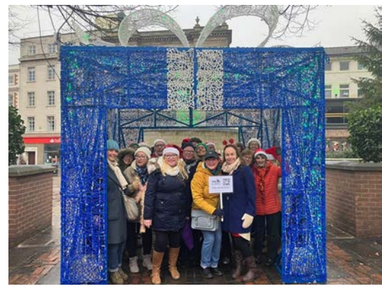
The Gems, all wrapped up