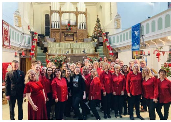
Bristol Fashion, Sonic, Chance Encounters, Specs Appeal, In The Wings, and Red Velvet