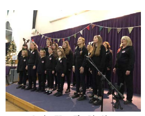
Junior FR at The Big Sing

witnessed an impressive £887.30 in direct donations, with an additional £105.33 expected through Gift Aid, bringing the total funds raised to a remarkable £992.63.