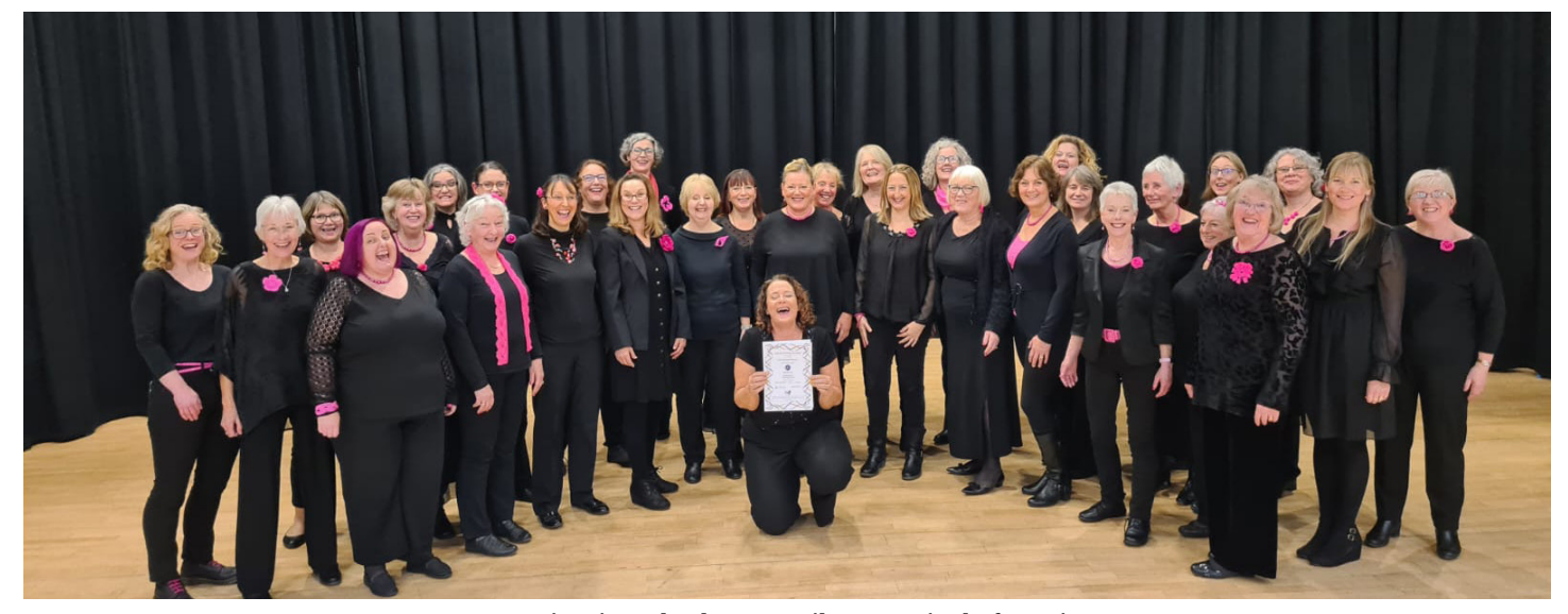
Fascinating Rhythm at Nailsea Festival of Music