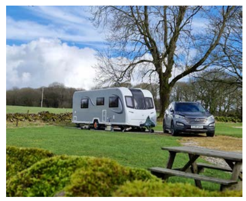
The Grand Tour caravan

I was delighted to attend Convention in Harrogate. There was no way I was going to miss it although our route had to take a bit of a diversion, much to my husband's amusement. Sitting in the audience I could see and hear the result of all the hard work of the choruses I had visited, as they performed their polished set pieces – WOW!