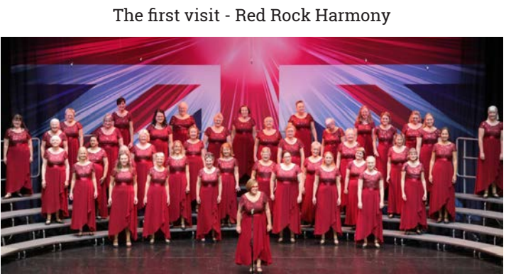
Harmony InSpires at Convention