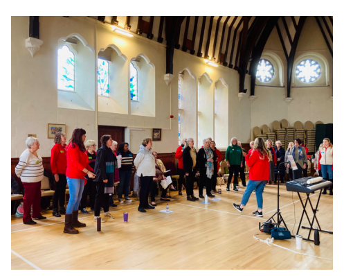
Lamorna leading a warm up