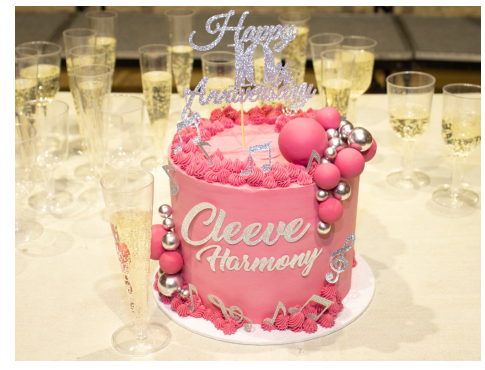
Delicious, and very beautiful, birthday cake!

anniversary in style throughout 2023, with parties, festivals, socials, and concerts galore!