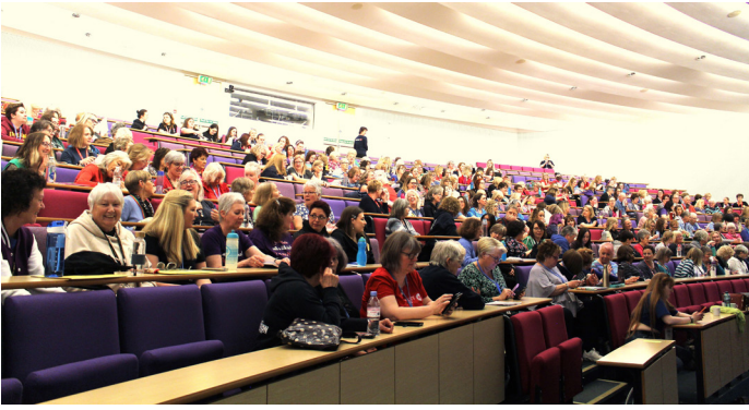
Harmony College delegates, raring to go!

'I was so nervous about going. I've never done anything like this before and I was really stepping out of my comfort zone. I needn't have worried. It was such a supportive, welcoming environment and I've learned so much. When