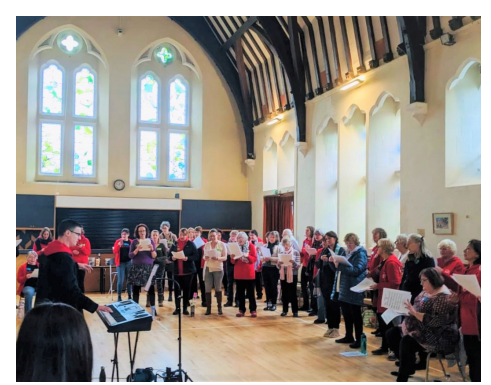
Tenor - Bari duets