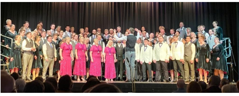
The Road to International finale

While a small group collected the risers from our rehearsal hall, the rest of the choruses and quartets converged on Pudsey Civic Hall, ready for final rehearsals. With rehearsals complete, excitement to share the stage with such talent grew, and before we knew it we were donning dresses, applying makeup and finalising our vocal preparation. We were ready for Showtime.