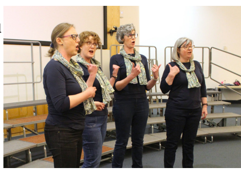
Gotta get with my friends!

we'd sung out a few times and thought the LABBS audience would enjoy. Oh