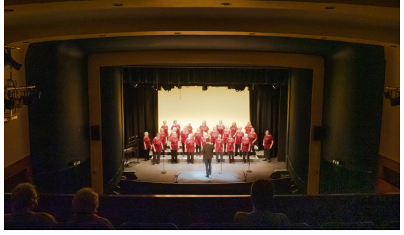
Main Street Sound at York Community Choir Festival

2022, Three Crown Sound from Hull were there too, but due to the number of choirs wanting to take part we had to narrow our catchment area this year!