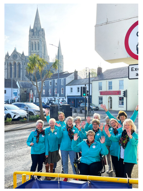
Our new rehearsal space is overlooked by the very beautiful Truro Cathedral

Perranwell for some time, but earlier this year we decided to look for a new venue. Amongst other things, we wanted somewhere closer to one of the bigger towns to give us a larger area to recruit from. And so, the hunt began in earnest.