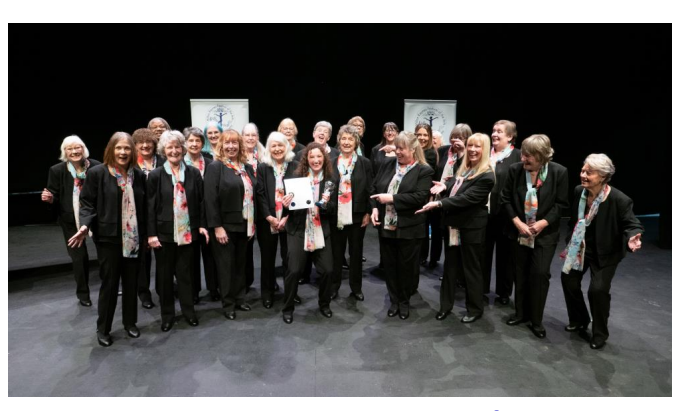
Junction 14: Fun, Enjoyment, Achievement

For more information, please see the advert on our website, <a href="www.junction14.org">www.junction14.org</a>, or get in touch at <a href="mailto:music.team@junction14.org">music.team@junction14.org</a>