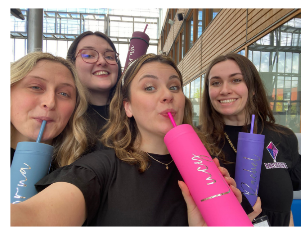
Chance Encounters at Harmony College

other delegates, and the response we got was overwhelmingly positive. It's left us feeling empowered and excited for the future of our quartet!