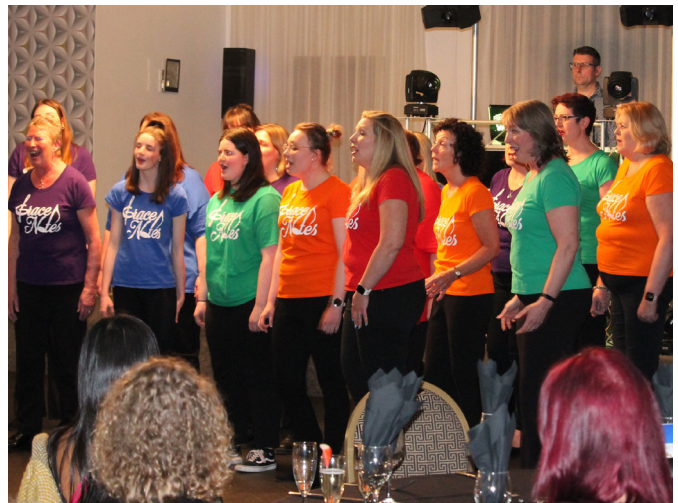
GraceNotes at ELEVATE

lifestyles, and raises awareness about mental health. Their ELEVATE event is a very popular fundraiser which features local performers like GraceNotes.