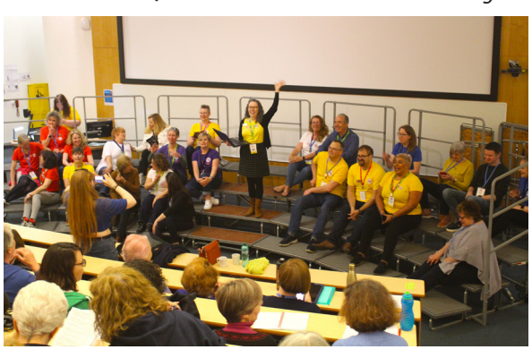
Harmony College Faculty

'Really informative weekend, and everyone – faculty and participants have been so supportive. It's been so good catching up with people too. And wow - such a great atmosphere!'