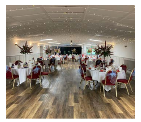
Annual Dinner table settings

In March we sang in Coventry Cathedral, having been invited by Creative Lives as part of the Coventry UK City of Culture. This was to show how those invited showed resilience, imagination and kindness as they kept people connected and expressed themselves creatively during the pandemic. We also did a singout for a Nuneaton WI group, The Treacle Tarts, which finally happened after