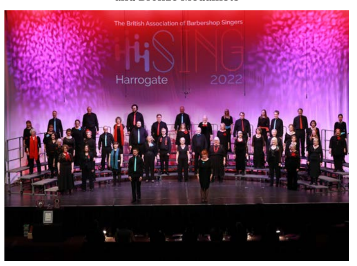
The Bristol Mix - BABS Mixed Chorus Contest Champions