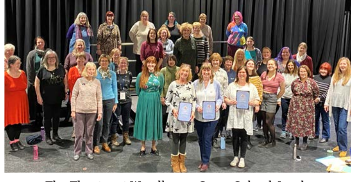
The Theatre at Woodhouse Grove School, Leeds