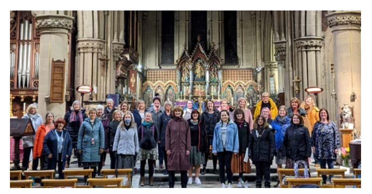
Gorgeous overtones at All Saints Church, Leeds