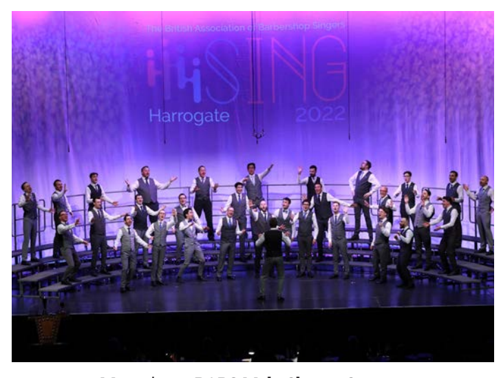
Meantime - BABS Male Chorus Contest Champions