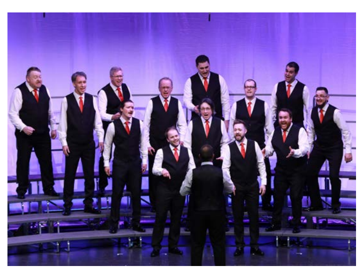
Malevox - BABS Small Chorus Award Winners and Bronze Medallists