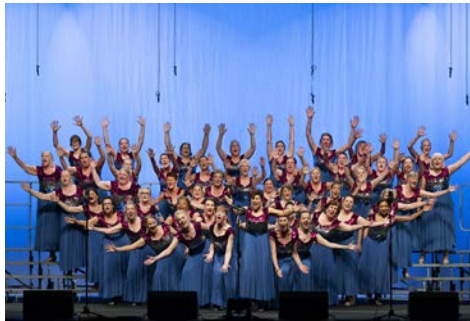
Amersham A Cappella