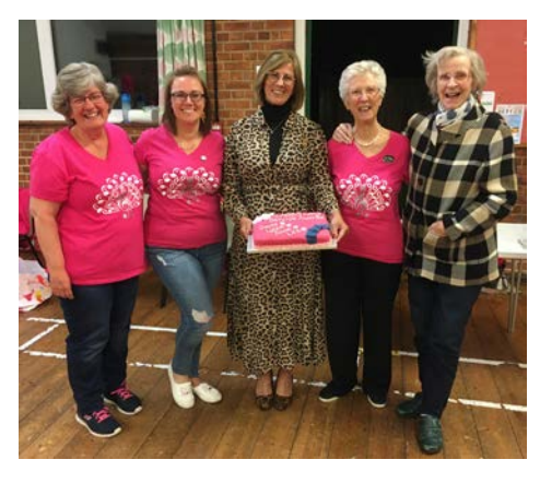
AAC Long Service Awards