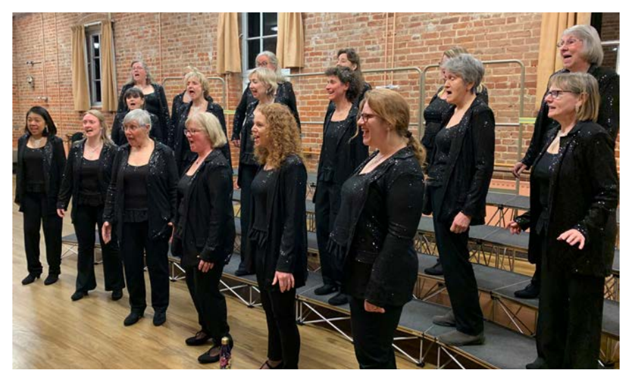
Welwyn Harmony dress rehearsal