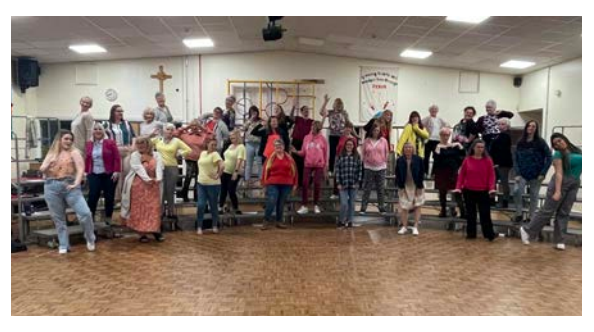
Joyful Rosettes celebrating being back on the risers