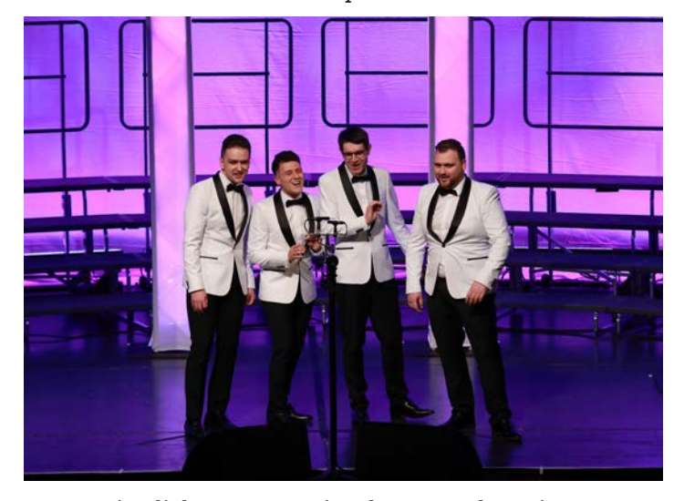
Limelight - BABS National Quartet Champions