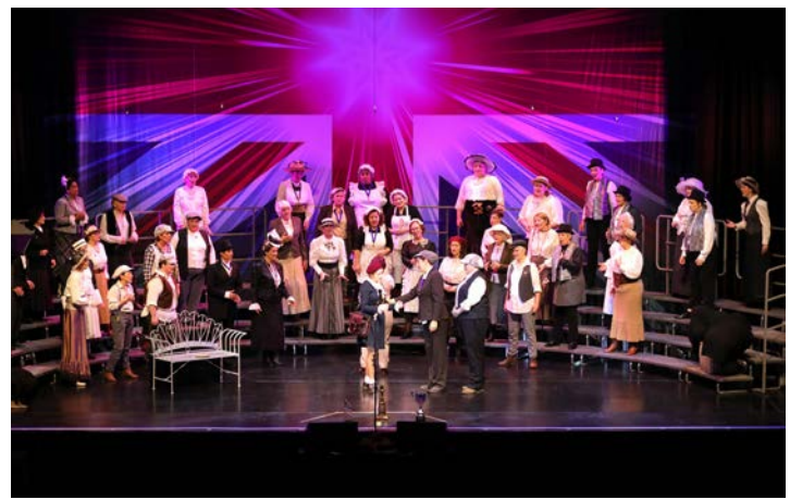
Bronze Medallist Chorus, Crystal Chords. Recipients of The Harmony, Incorporated Trophy, The Westering Trophy, and The BABS Entertainment Trophy