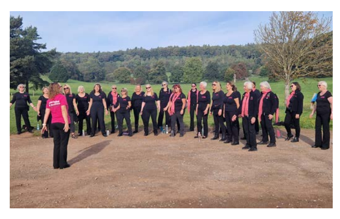
Singing for St Peter's Hospice