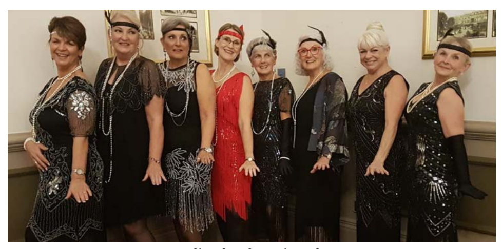
Ladies that do tea in style