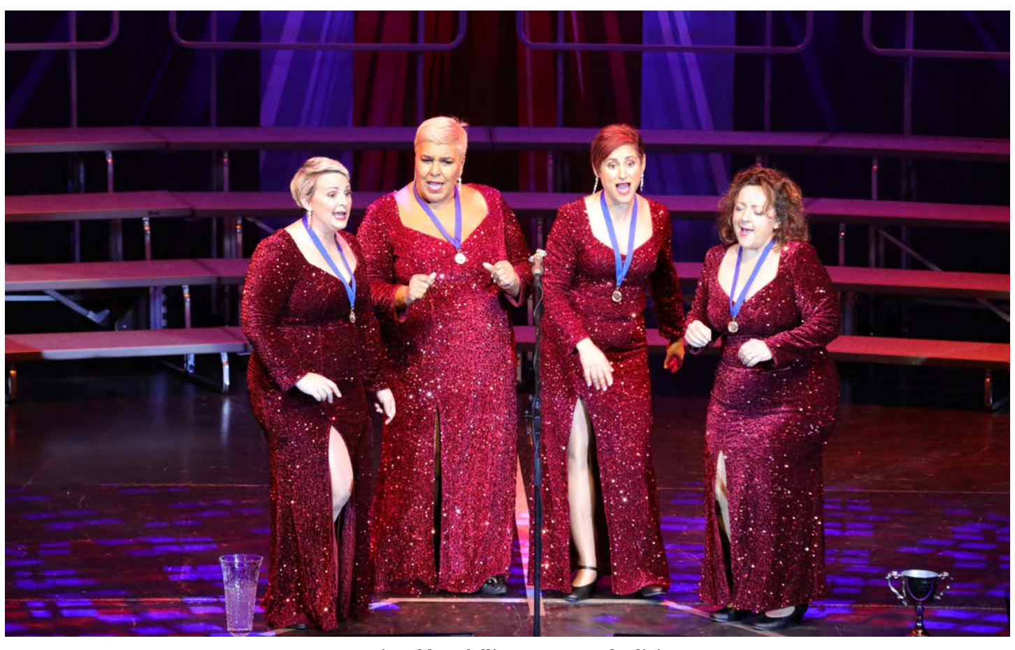
Women's Gold Medallist Quartet, Barberlicious. Recipients of The LABBS Champion Quartet Trophy, The Indigo Blue Trophy, and The Pzazz Trophy