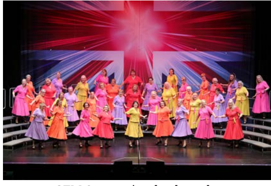
GEM Connection, back on the competition stage