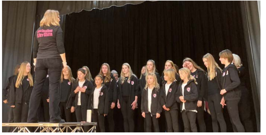
Junior Fascinating Rhythm sing at FRs table top sale