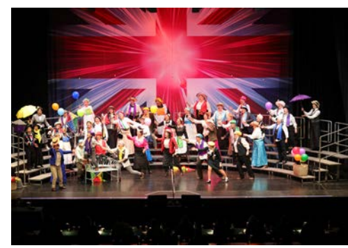
Crystal Chords on stage

weekend in Harrogate, we are still on a high, polishing our medals and trophies!