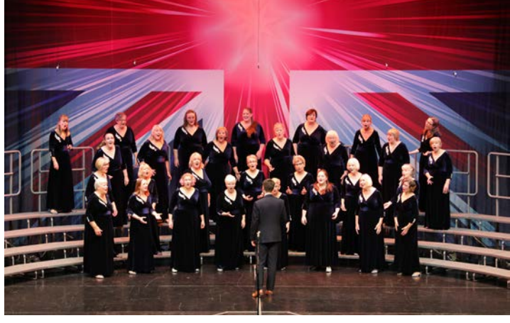
Main Street Sound