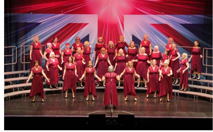
Cheshire A Cappella