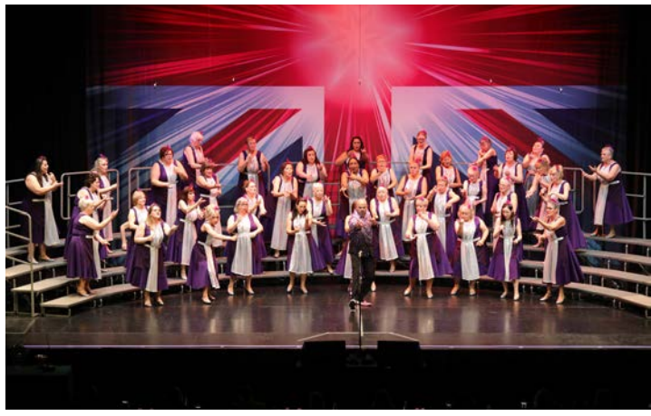
Second City Sound