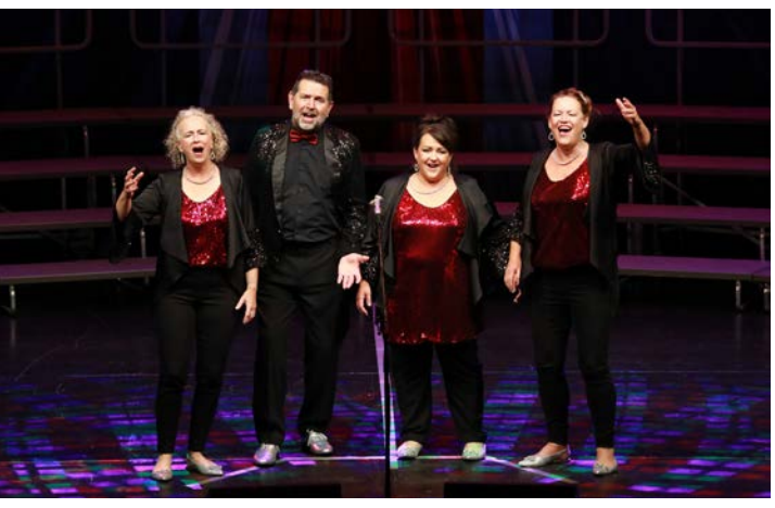
Mixed Bronze Medallist Quartet, Jam First