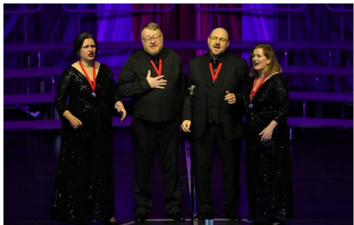
Mixed Silver Medallist Quartet, Powerhouse