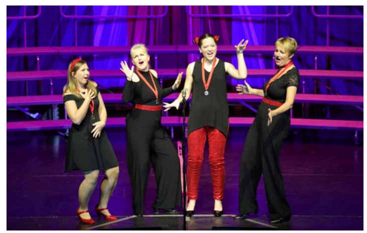
Women's Silver Medallist Quartet, Muddy Stilettos. Recipients of The Holland Harmony Trophy, and The Crackerjack! Trophy