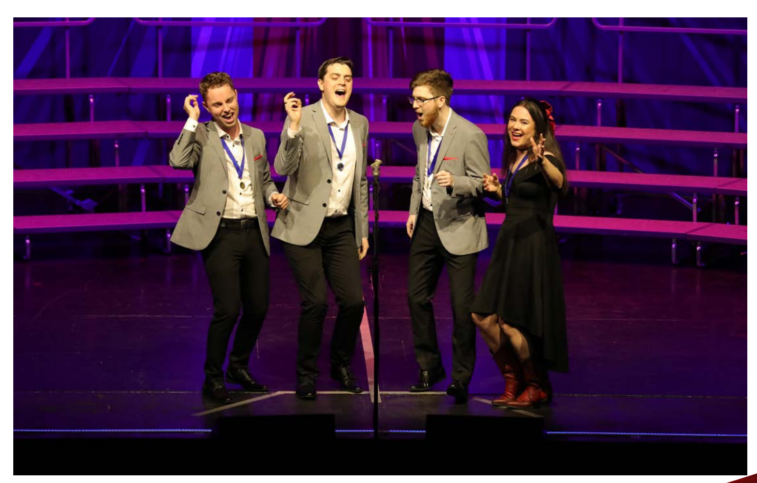
Mixed Gold Medallist Quartet, Hot Ticket