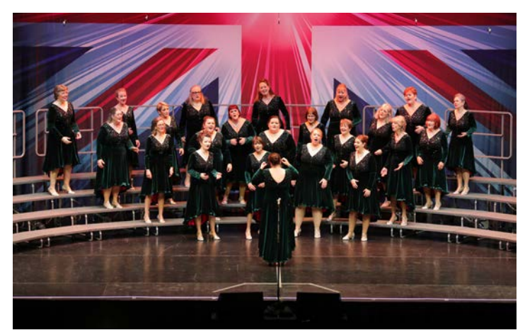
A Bunch of Roses