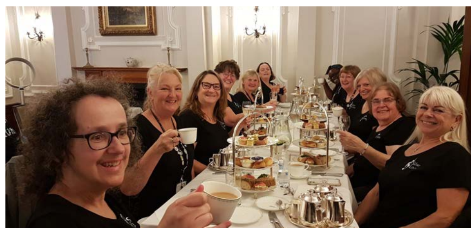
Some, but not quite all, of the Basses at Betty's