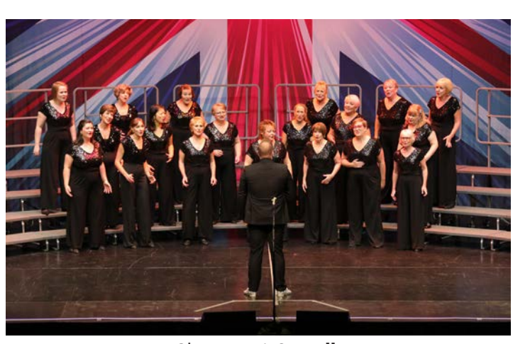
Signature A Cappella