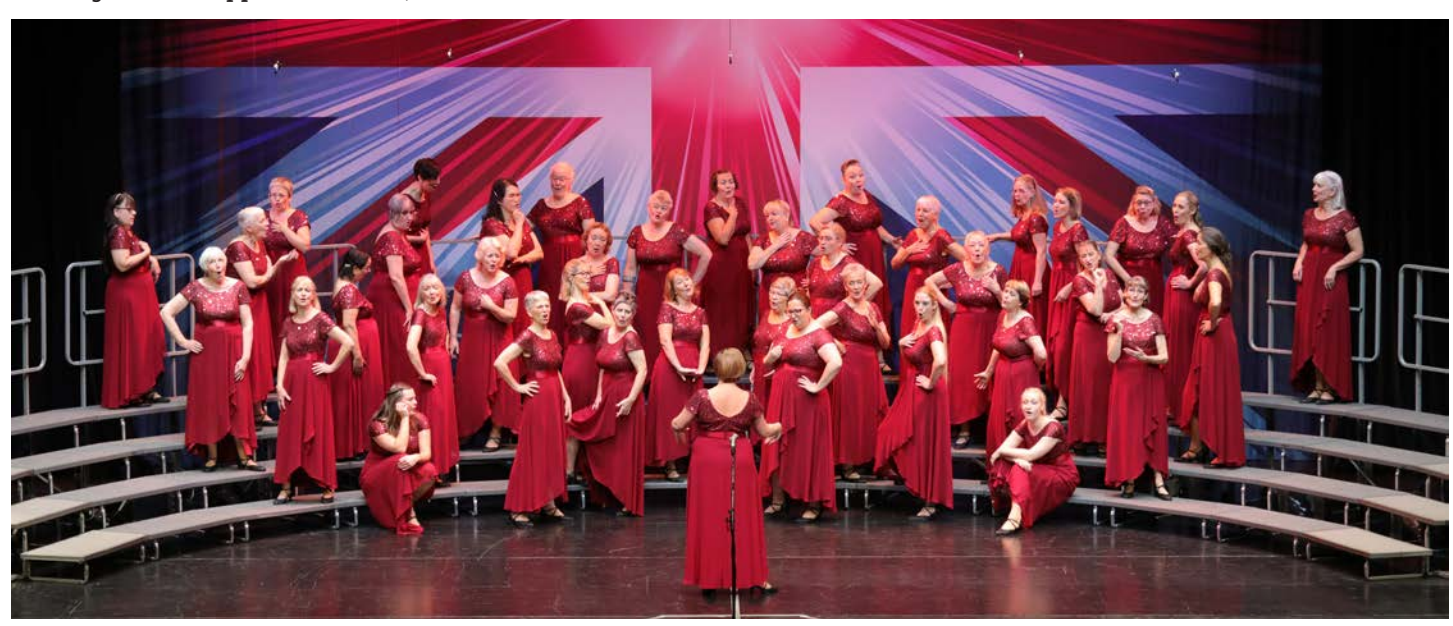
Harmony InSpires on the stage in Harrogate