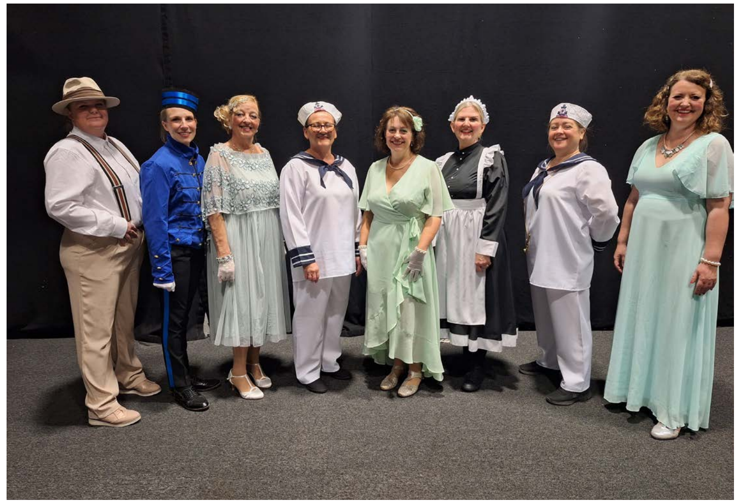
New members, ready to board the SS Spinnaker.