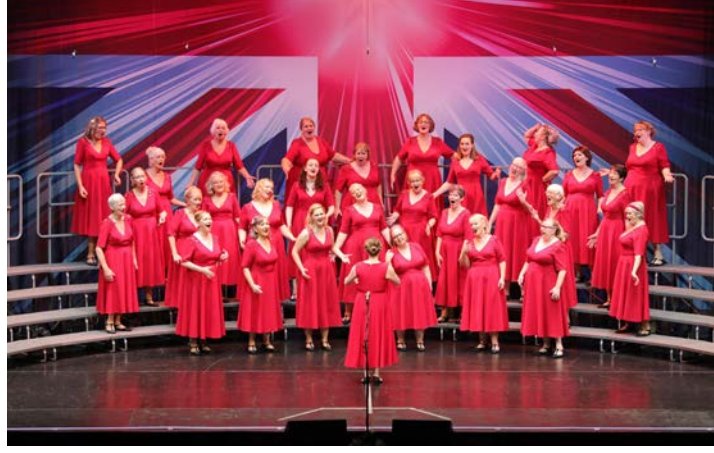
The Belles of Three Spires