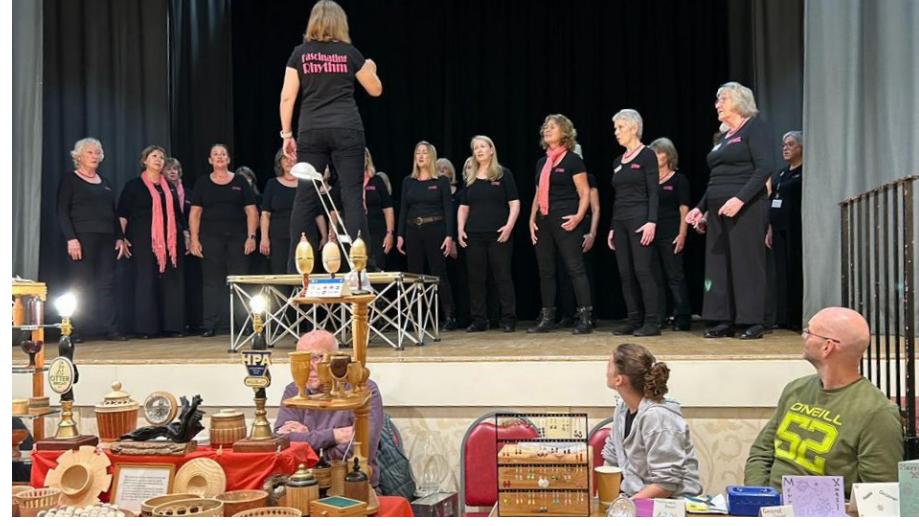
FR at their table-top sale

It was the infusion of melodious entertainment that truly set the sale