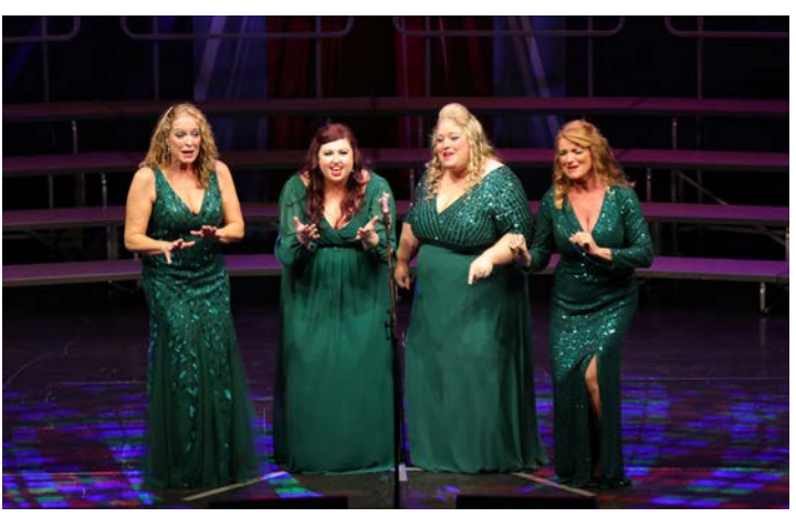
Fifth & Madison