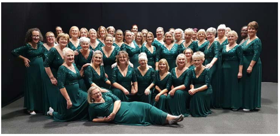
Our fabulous new dresses - we love them!