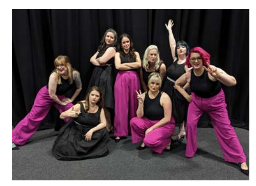
Shenanigans and The Bakewell Tarts

We didn't believe Emma when she read out the Prelims results and said that we'd come seventh, but with four months to get used to that fact, we'd spent the time preparing to give our very