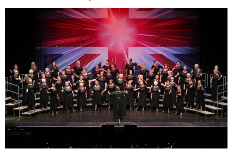
The Red Rosettes