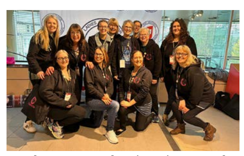
Red Rosettes at the First Timers Desk

first time in four years, with 13 newbies and two unborn babies on board, and we absolutely loved it. Our newbies were blown away by the love and support of the whole LABBS community, thought the Afterglow was amazing, and were spoiled for choice on who to sing with. They also commented that they didn't realise how emotional it would be, and loved Sing with the Champs and the Mass Sing. I think they may stick around!