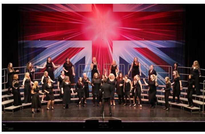
London City Singers