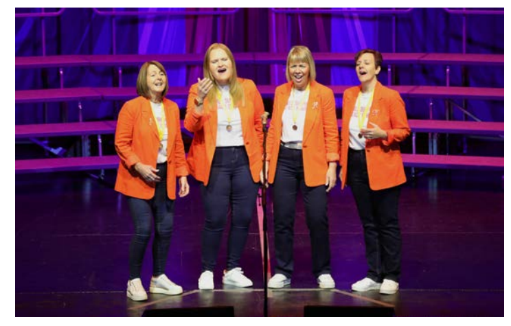
Women's Bronze Medallist Quartet, Northern Soul. Recipients of The Guildford Harmony Trophy