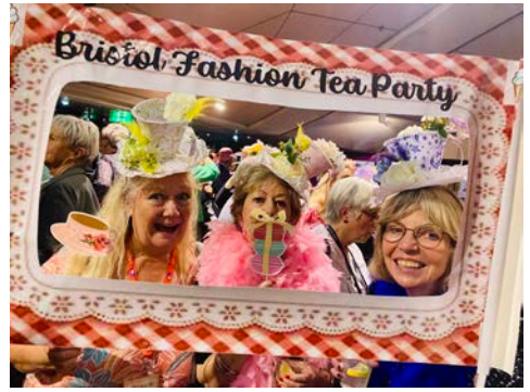
Bristol Fashion: Ready to Tea Party!

So, a 'Love to Sing' course complete with newbies was our theme – perfect! After all, it's how many of us found our way