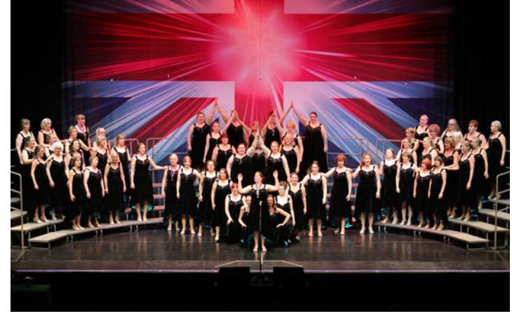
The White Rosettes