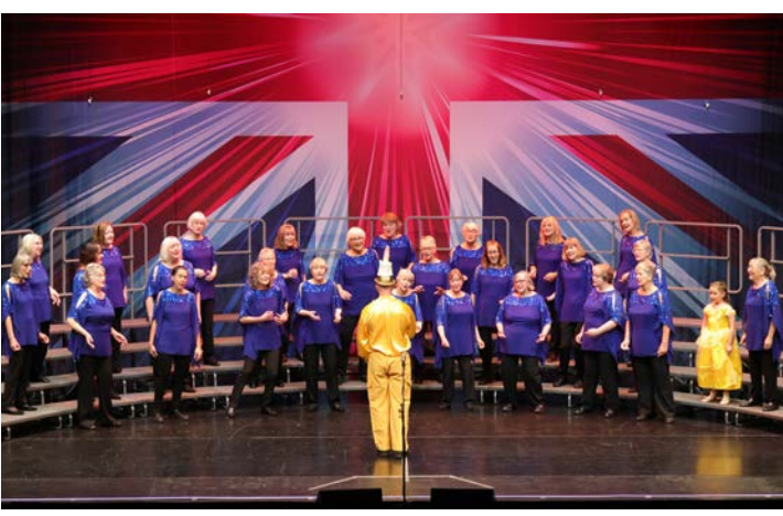
One Acchord, recipients of The Harmony InSpires Trophy