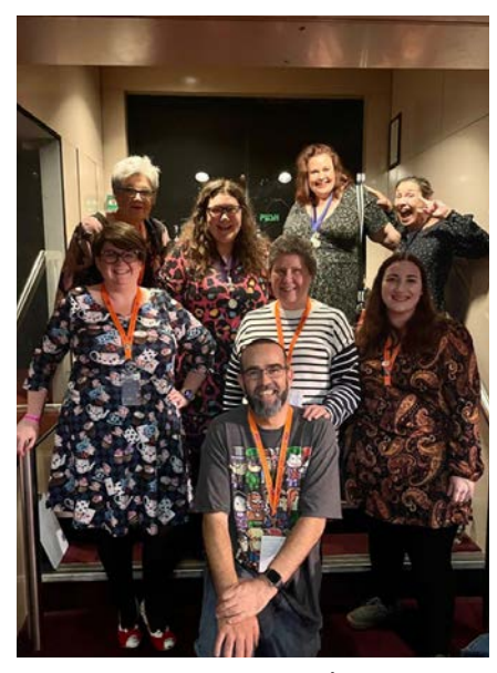
STS at Convention