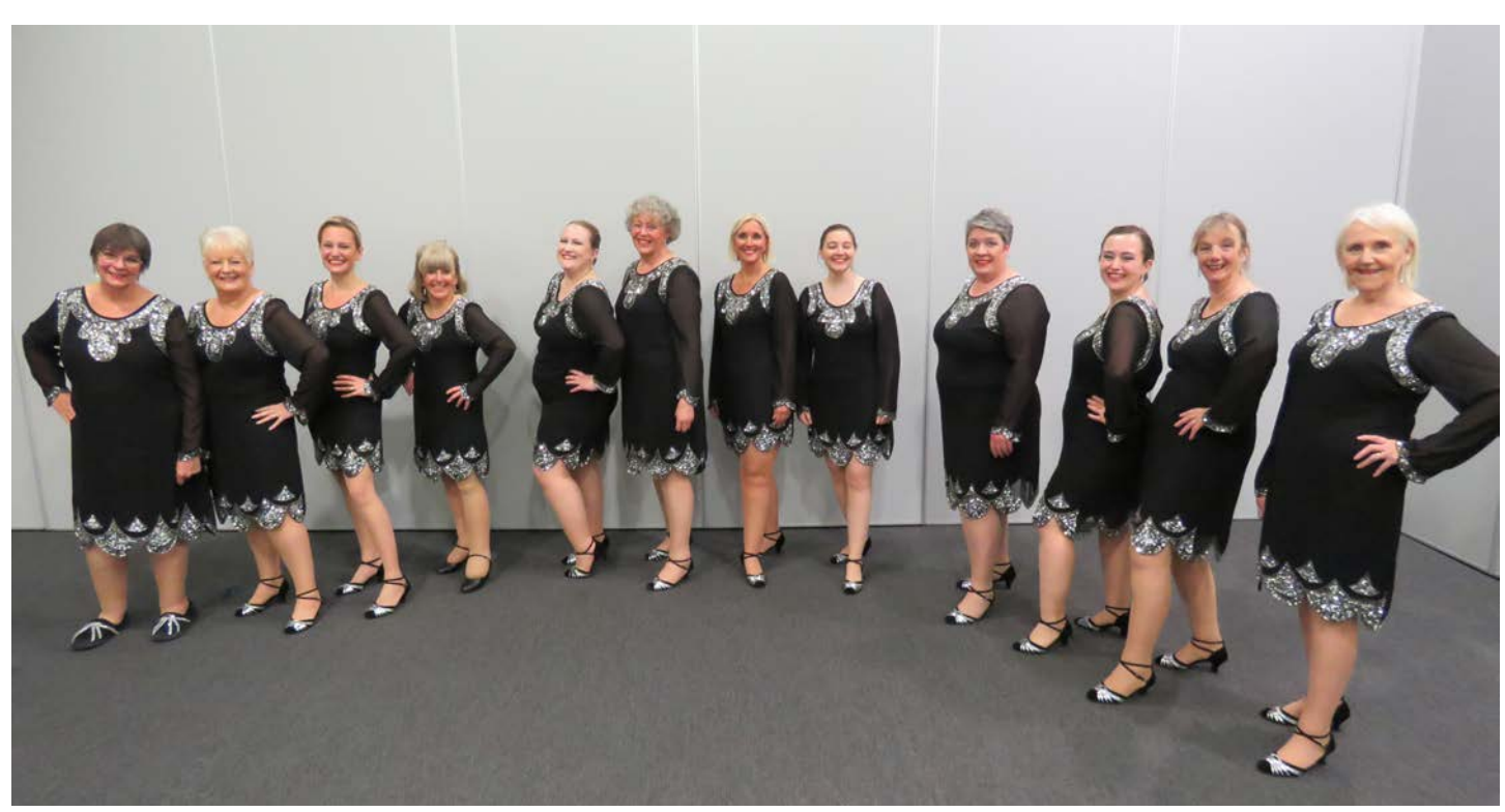
The Abbey Belles First Timers