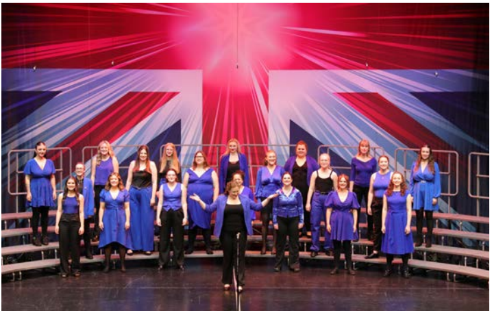
LABBS Youth Chorus, recipients of The Phoenix Trophy