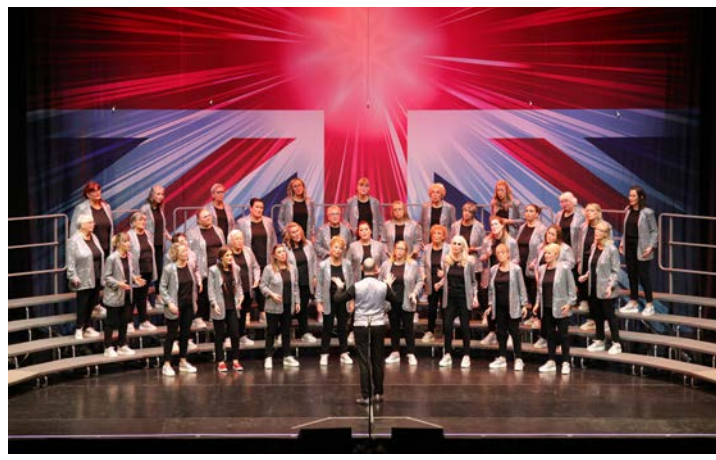
Affinity Show Chorus