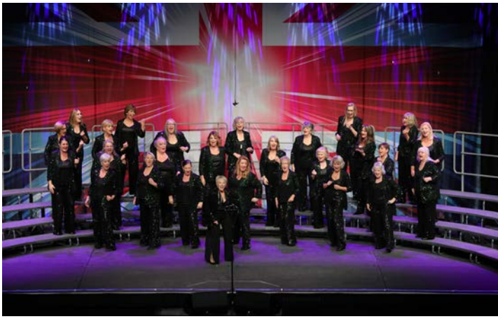
Red Rock A Cappella