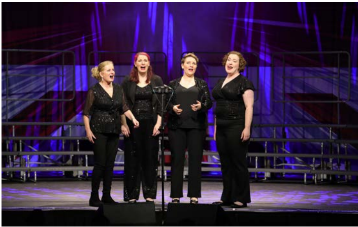
Final mic warmers: Steelettos