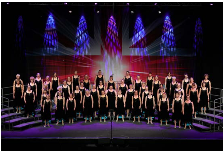
Silver Medalist Chorus: The White Rosettes, recipient of The White Rosettes Trophy: Second Place