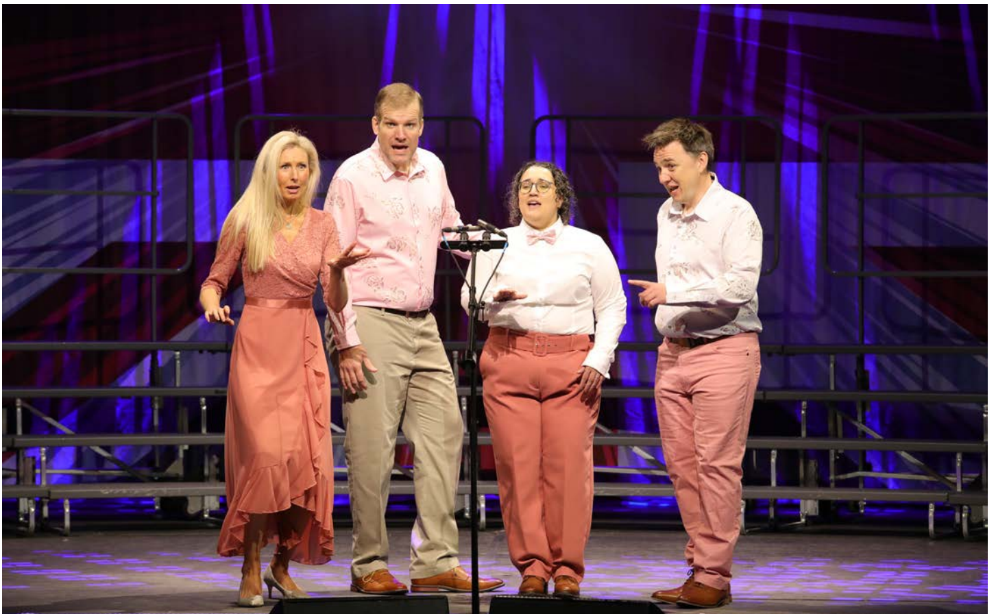
Mixed Quartet Gold Medalists: The Light Fantastic