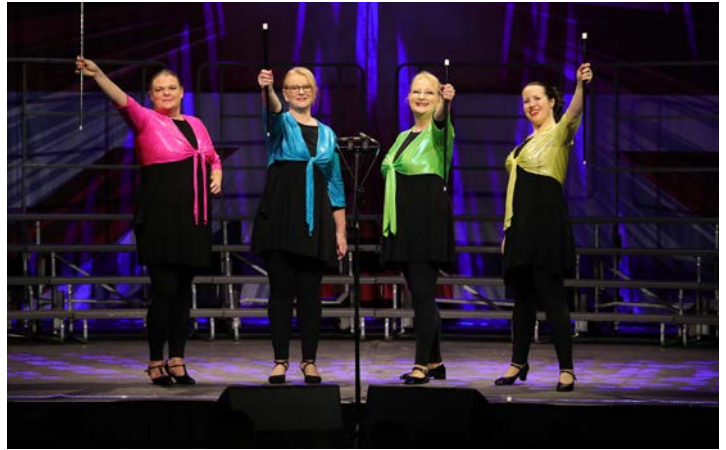
Semi- Final mic warmer: Fourtuned Cookies