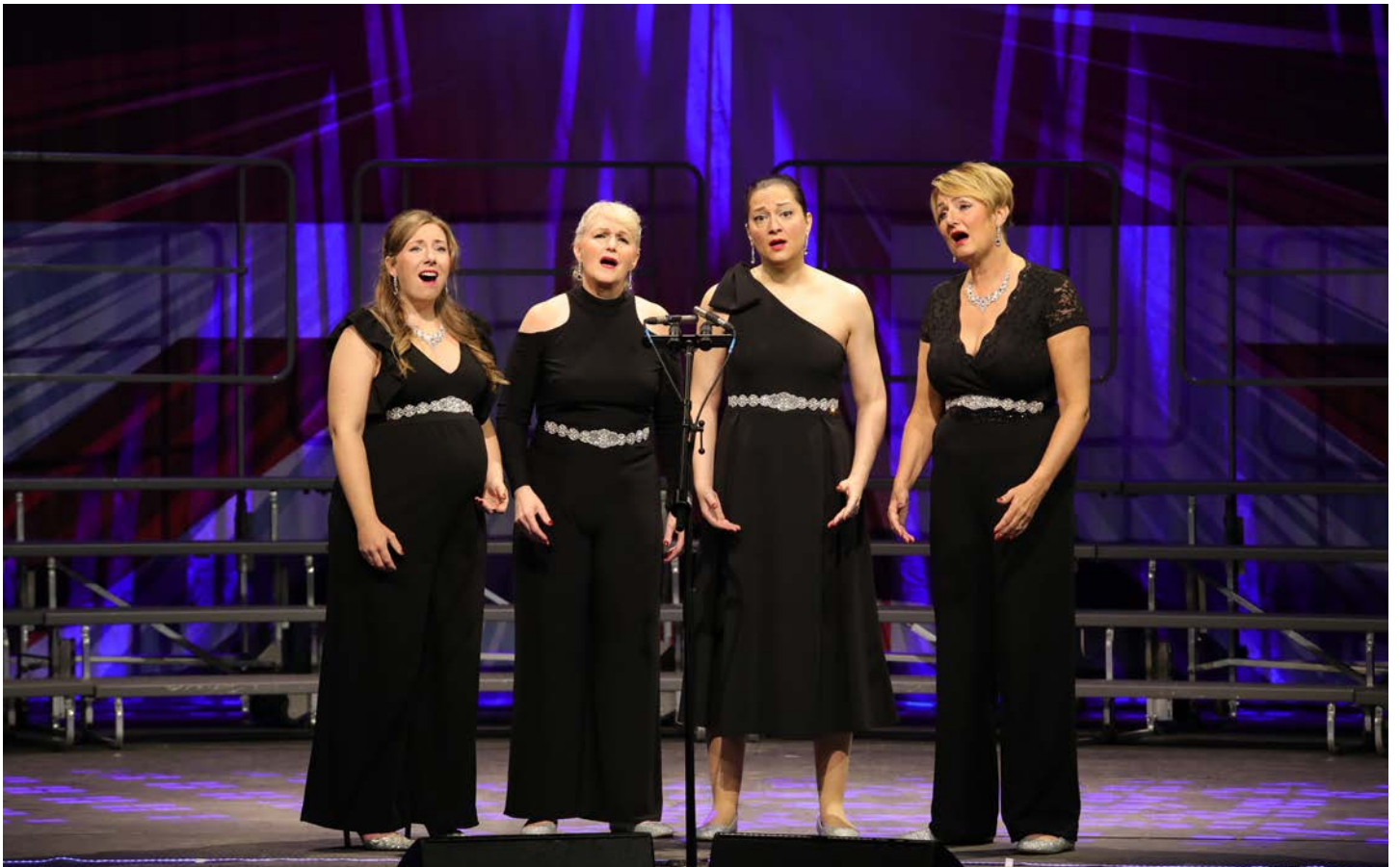
Women's Gold Medalist quartet: Muddy Stilettos, recipients of The LABBS Champion Quartet Trophy: Gold Medal Quartet, The Indigo Blue Trophy: Highest Marks in Singing Category, The Pzazz Trophy: Highest Marks in Performance Category, The Crackerjack! Trophy: Highest Marks in Music Category