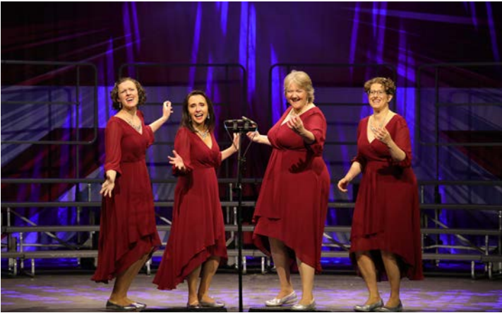
Women's Quartet Bronze Medalists: Sonic, recipients of The Guildford Harmony Trophy: Bronze Medal Quartet