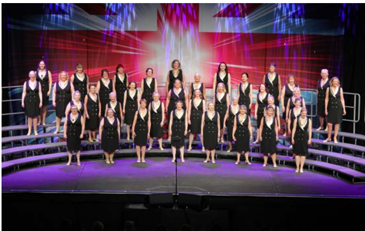
The Belles of Three Spires