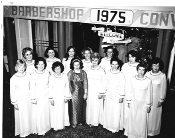
Avon Harmony 1975

So many members of both of these choruses, and indeed many others