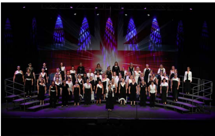
Mic warmer number two and mic cooler: Cheshire Chord Company