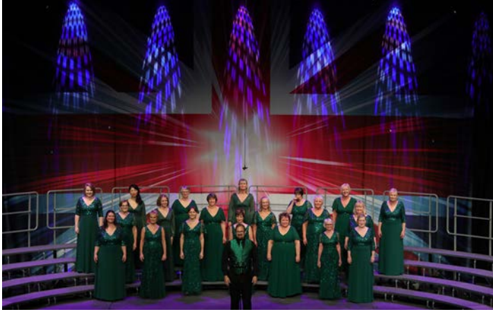
Signature A Cappella Singers