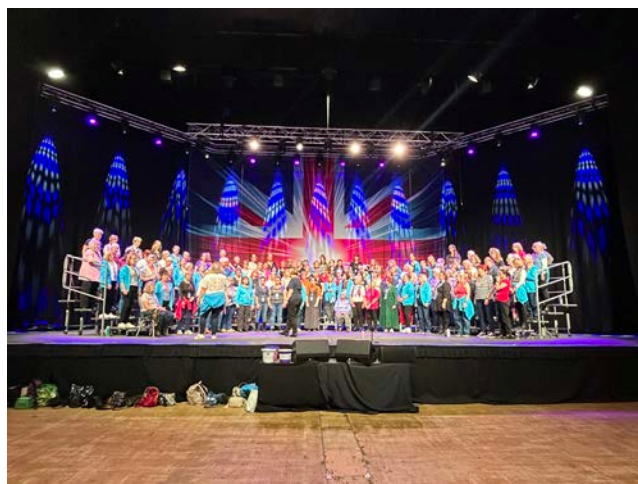
Sing with the Champs

If you missed the fundraiser, don't worry – you can still help us make it to