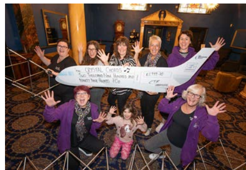
Manchester Airport Community Trust Grant presentation