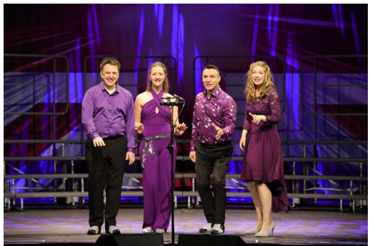
Mixed Quartet Silver Medalist: From the Top