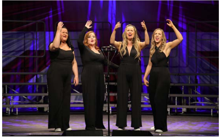
The Rolling Tones