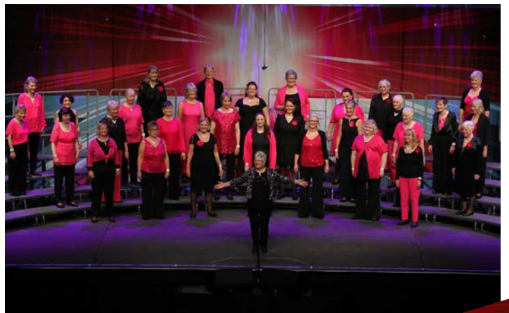
The Chordettes Acappella Chorus