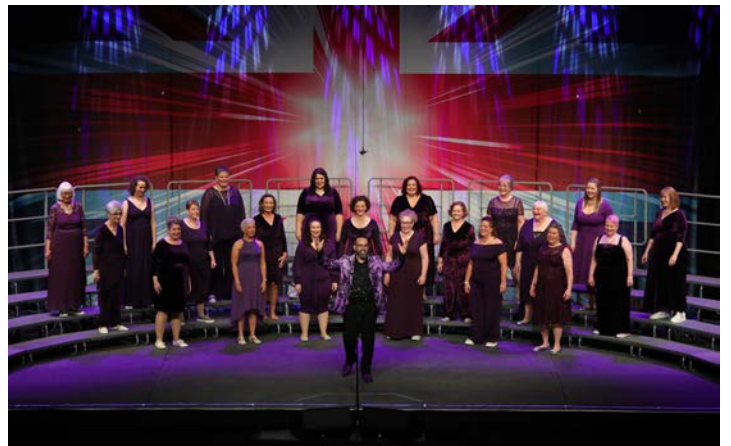
Six Town Sound, recipient of The Phoenix Trophy: Small Chorus Division Winner