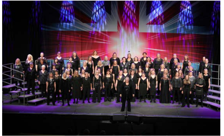
Acappella Sound, recipient of The Harmony InSpire Trophy: Highest placed chorus combined with the highest percentage of new members