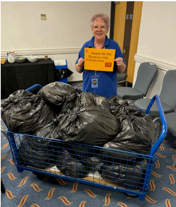
In addition, around 20 bags of bras were collected to raise money for the Yorkshire Air Ambulance

A tombola with donated prizes raised £247 and RNLI merchandise sales and donations raised £323, which was a fantastic total for the RNLI of £570.