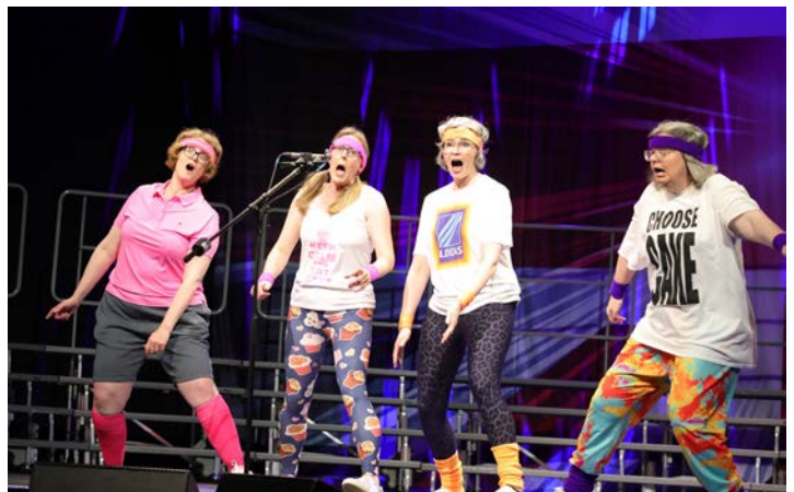
Jen Mills Award Performance: SpecsAppeal