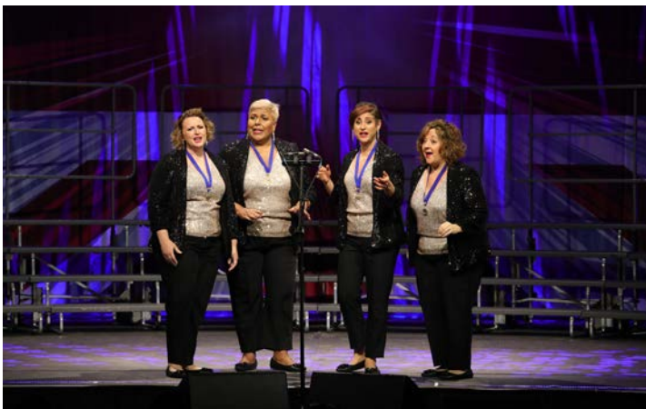
Outgoing Champs: Barberlicious