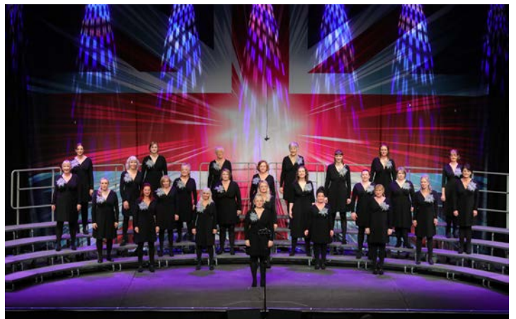
Mic warmer number one: A Slice of Cheshire