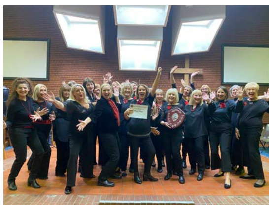
Cheshire A Cappella Chorus celebrating their victory

energy with the lively, rhythmic Viva La Vida , before closing with Seasons of Love , leaving the audience moved by our heartfelt harmonies and unified sound. Winning the John Riches Memorial Shield is a significant milestone, symbolising not only our hard work and dedication but also the beginning of this new chapter