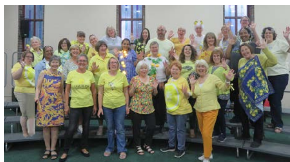
Second City Sound dress up for National Lemon Day

In true Second City Sound spirit, we're embracing the lemon theme to spread excitement.