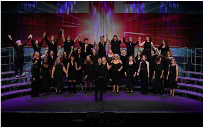
Bronze Medalist Chorus: London City Singers, recipient of The Harmony Incorporated Trophy: Third Place, The BABS Entertainment Trophy: BABS' selection, for most entertaining chorus, The Red Rosettes Award: Mid-size Chorus Division Winner