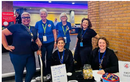
Crystals at LABBS

It's been a jam packed few months for Crystal Chords, starting with the excitement of a new set of risers and that's despite only deciding to take the plunge earlier in the year. Our committee set about fundraising and selling our existing set of Wengers in the spring and a combination of luck and hard work all came together when