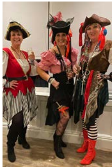
Three Friendly Pirates