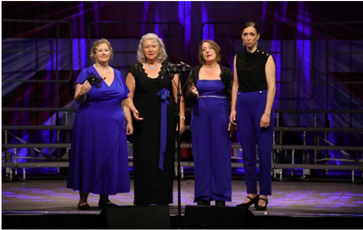
Semi-Final mic warmers: SPLASH!