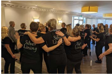
Silver Lining Warm up