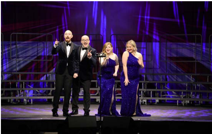
The Sharrow Vale Blues