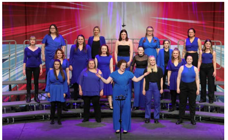
The LABBS Youth Chorus