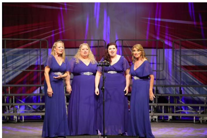
Women's Quartet Silver Medalists: Fifth & Madison, recipients of The Holland Harmony Trophy: Silver Medal Quartet