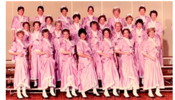
Capital Connection, Las Vegas, 1984, 2nd row, 2 in from left