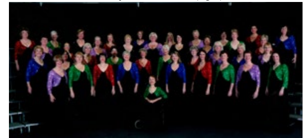
J14, Harrogate 2014, Outside left 2nd row in dark blue