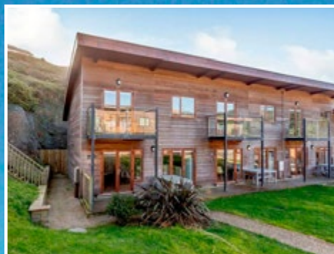
4 BEDROOM BEACH HOUSE Bodannon, Porthtowan

At Cornish Holiday we offer wonderful, self-catering accommodation in Cornwall. Our properties are inspected every year and receive a star rating by Visit England, a wonderful way to reassure you and give peace of mind when booking your stay. Every year Cornish Holiday donates to Cancer Research UK and by staying with us helps fund vital research. There really is nowhere better to spend time and create memories which will last forever.