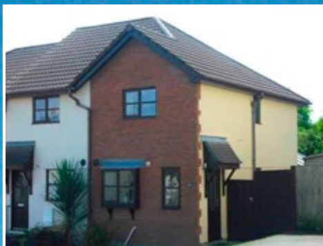
2 BEDROOM HOUSE Meadow Rise, St Columb Major

Glorious Cornwall, you will never want to go home!