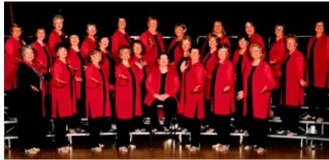
J14, Bournemouth, 2011, Front row, far right

In November the same year, Chiltern Harmony put on a show at the Wycombe Swan with Thames Valley Chorus with Pam Ayres as our special guest. She wrote a song especially for us called, 'I wish I'd worn a bra'. It was a super night and marked the end of my time with Chiltern Harmony.