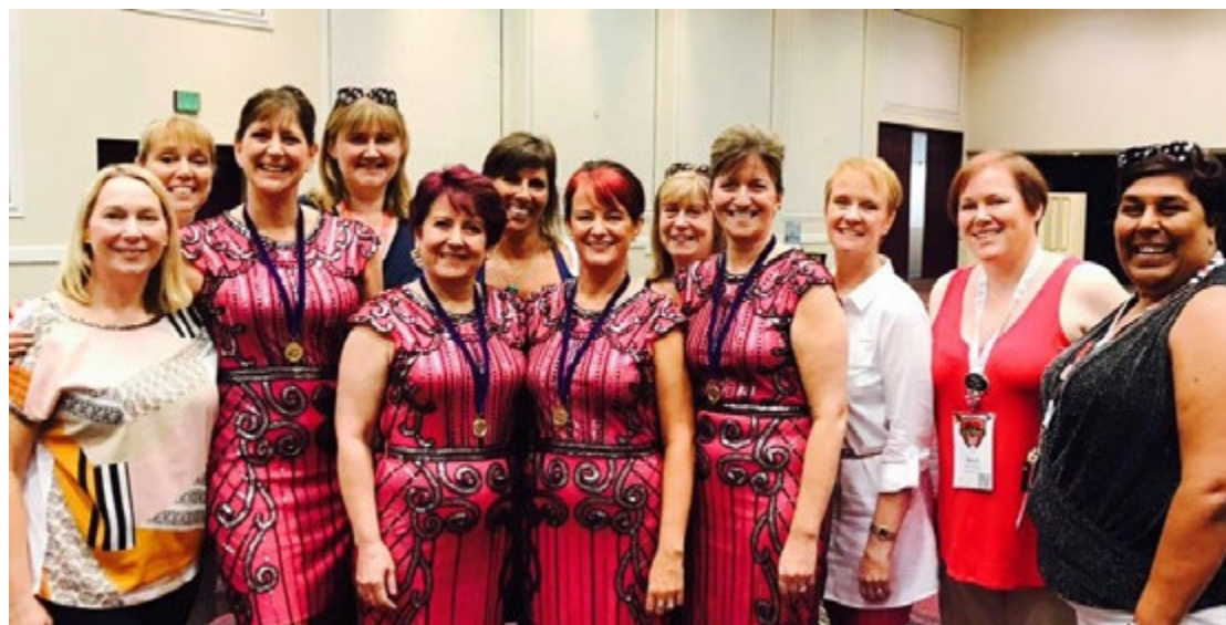
Pzazz representing LABBS at the WHC showcase in 2017